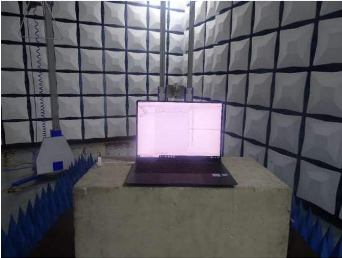
Radiated Spurious Emission (1GHz to18GHz)