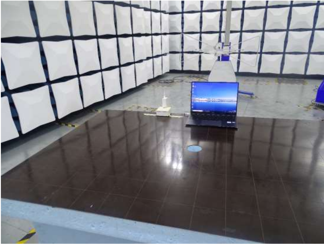
Radiated Spurious Emission (30MHz to 1GHz)