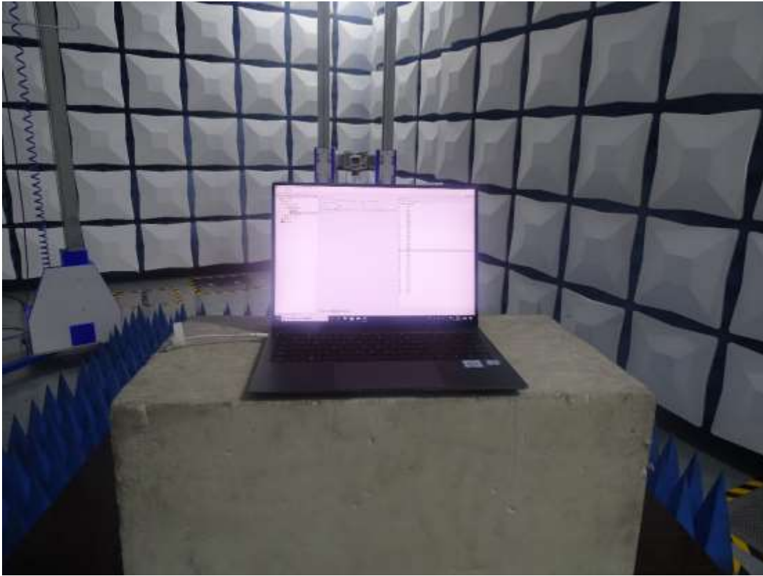
Radiated Spurious Emission (above 18GHz)