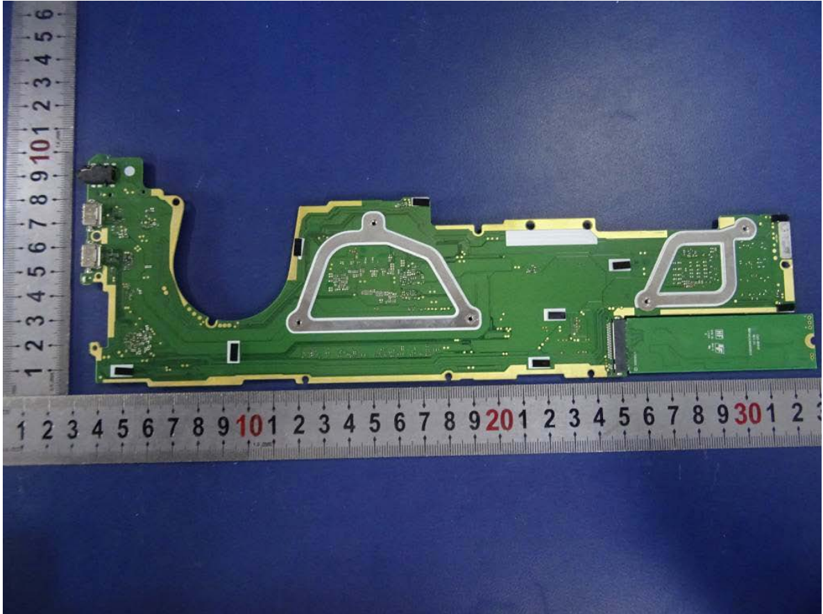
MACH-W19,MACH-W29(with GPU baord)