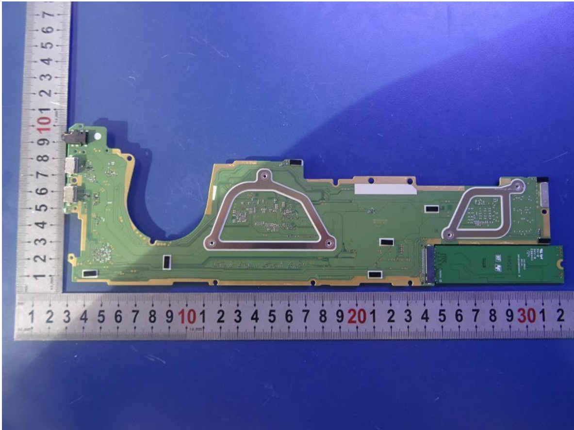
MACH-W19(without GPU board)