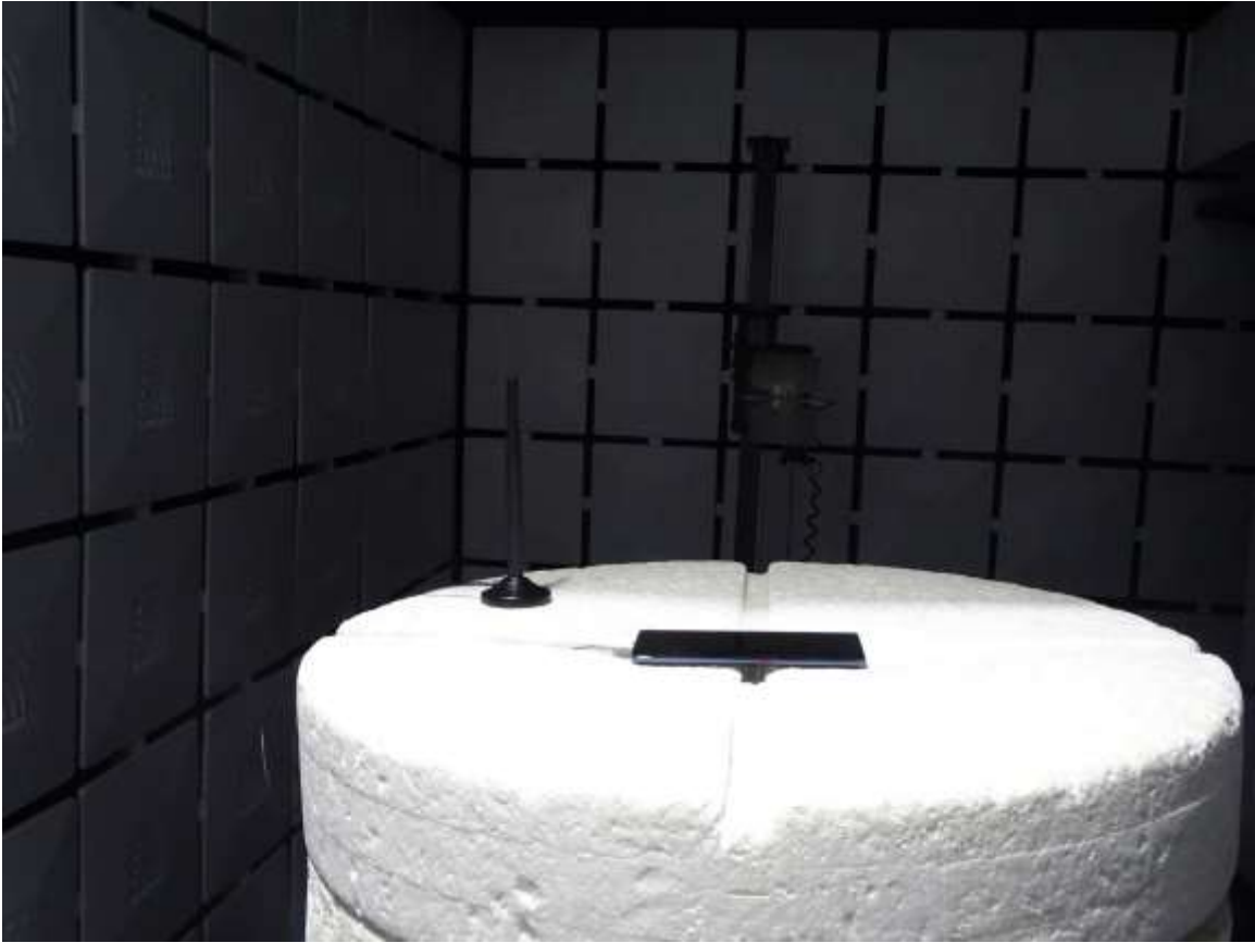
Radiated Spurious Emission (3GHz to18GHz)