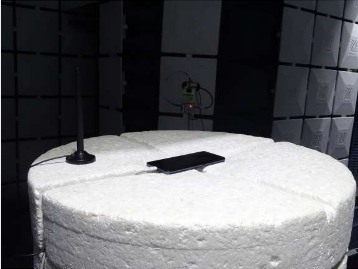
Radiated Spurious Emission (18GHz to26.5GHz)