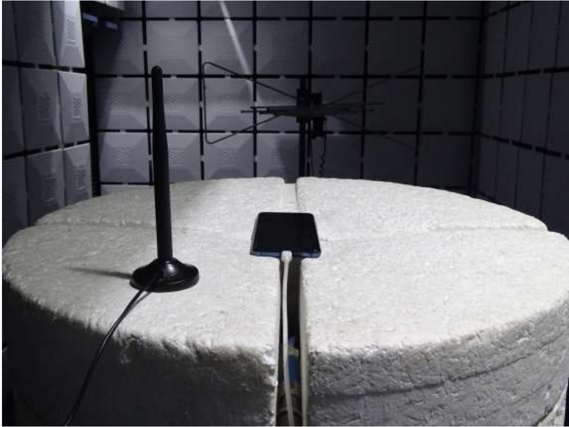
Radiated Spurious Emission (30MHz-3GHz)