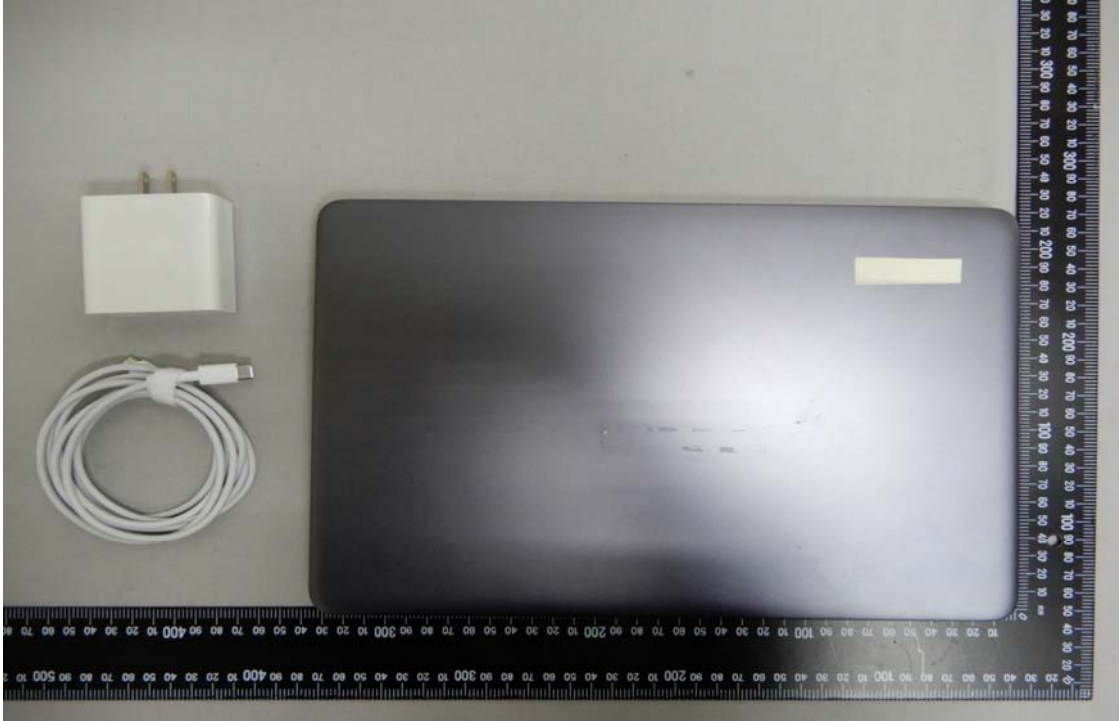
Front View of EUT-1