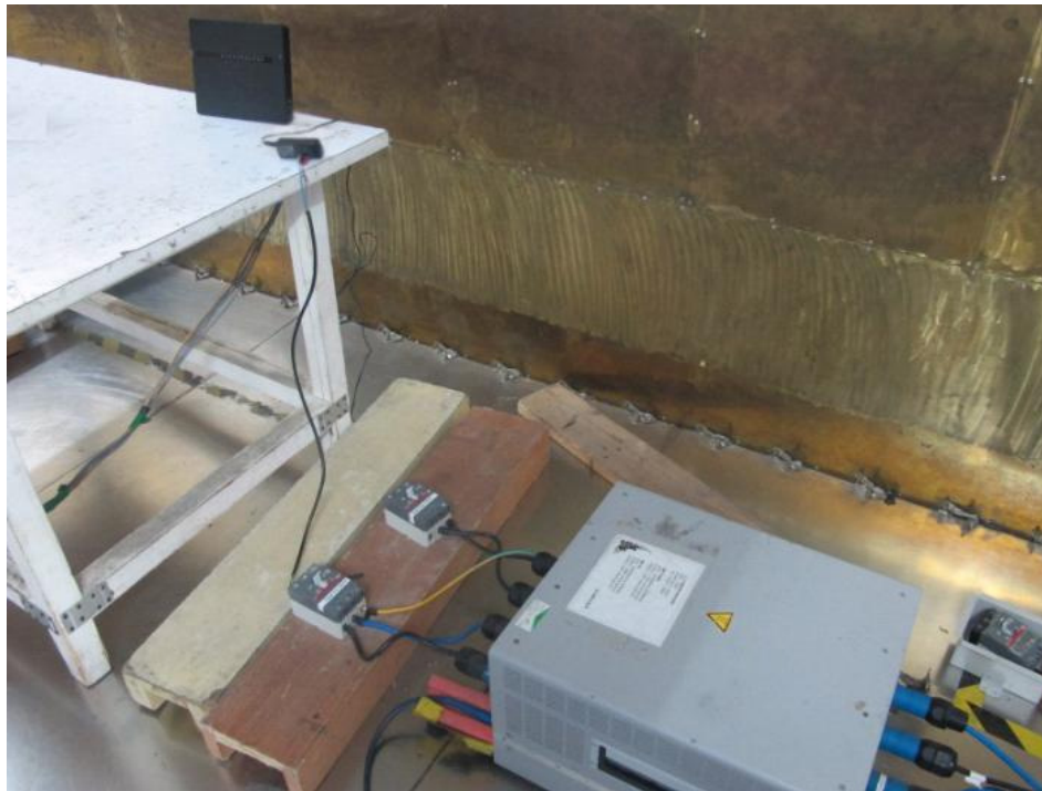
Conducted emissions of AC power port