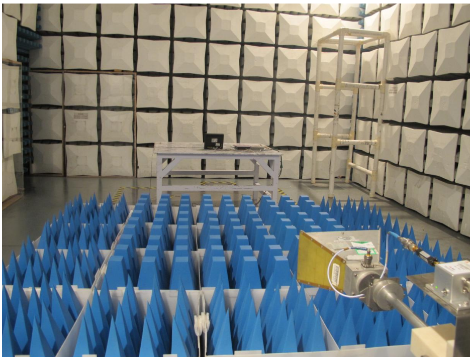
Radiated emission for 1GHz to 18GHz