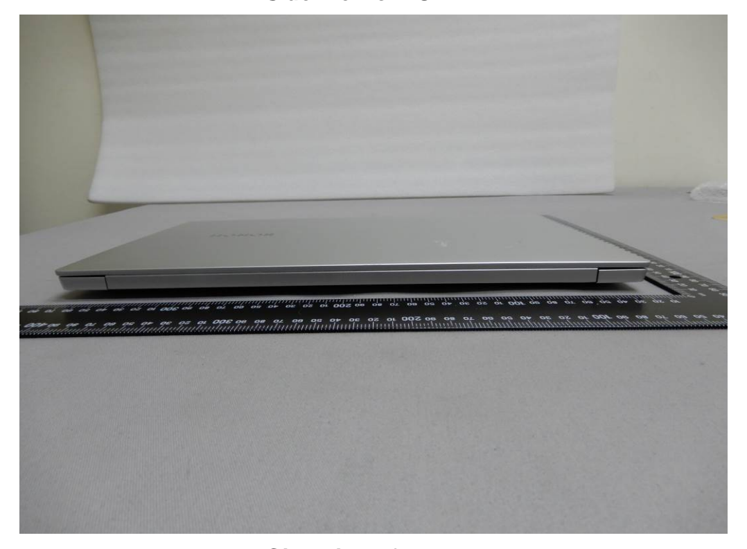
Side View of EUT - 3