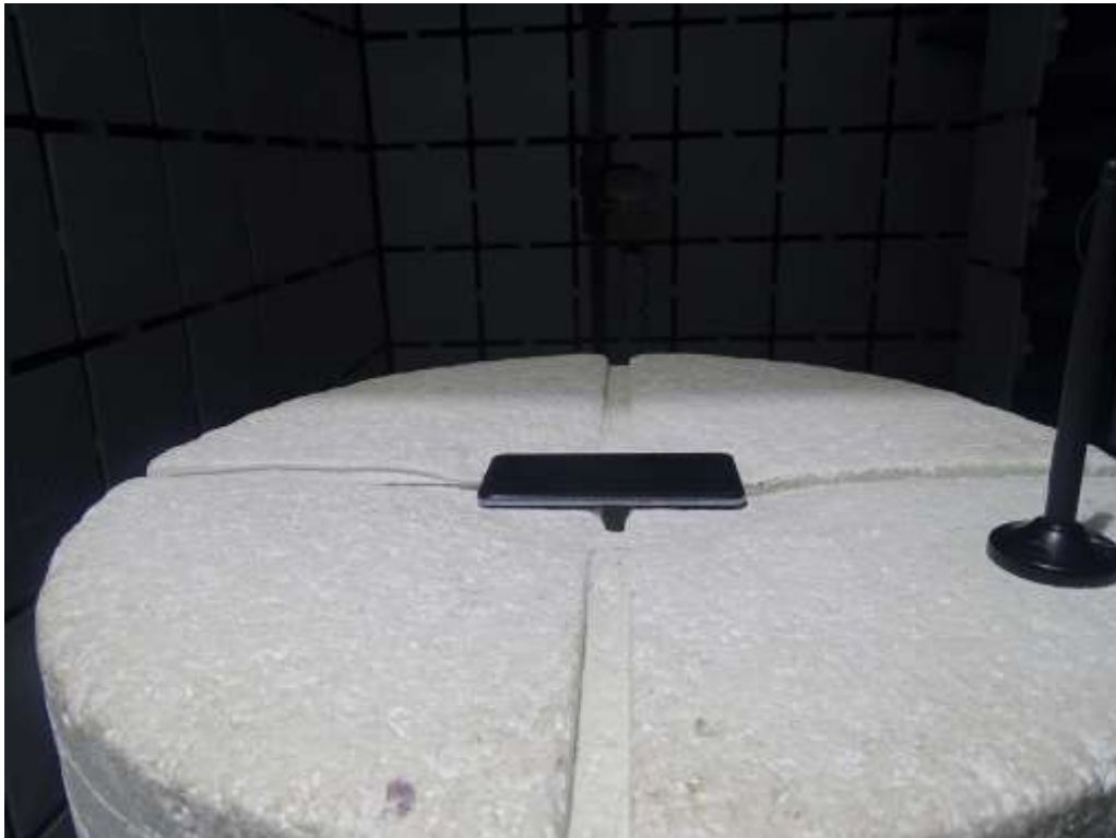
Radiated Spurious Emission (3GHz to18GHz)