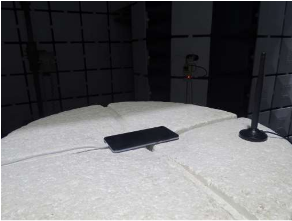
Radiated Spurious Emission (18GHz to26.5GHz)