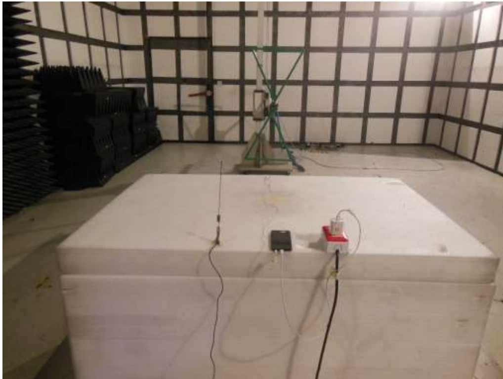
Radiated Spurious Emission (30MHz to 1GHz)