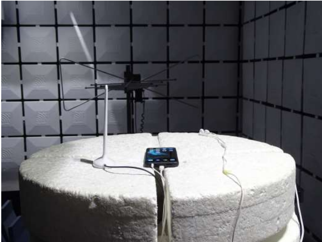
Radiated Spurious Emission (30MHz to 3GHz)