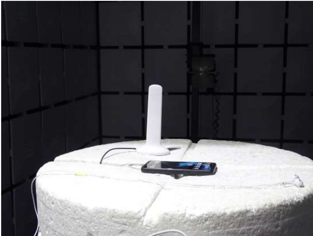
Radiated Spurious Emission (3GHz to18GHz)