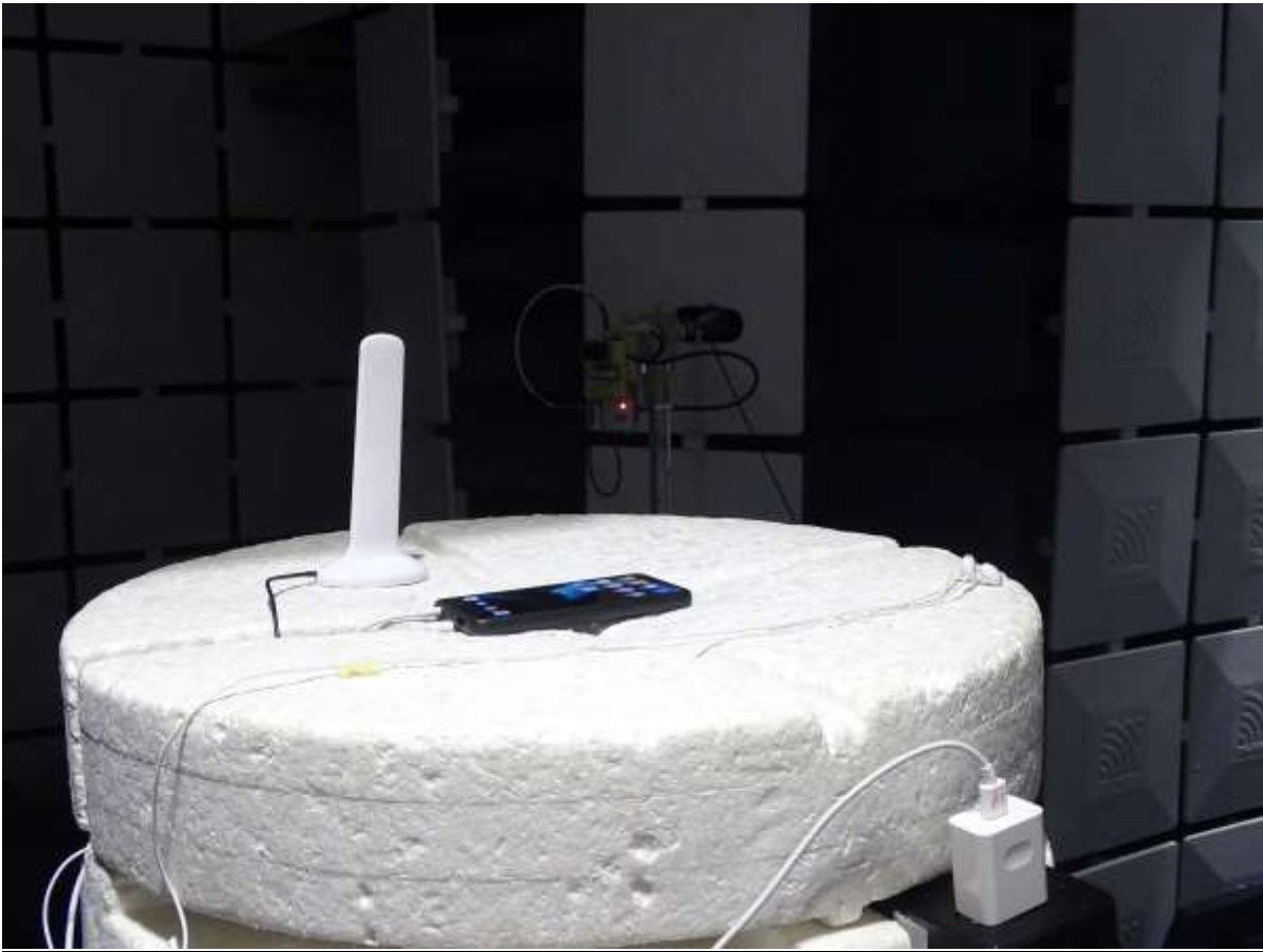
Radiated Spurious Emission (18GHz to26.5GHz)