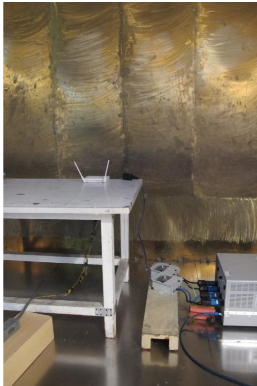
Conducted emissions of AC power port