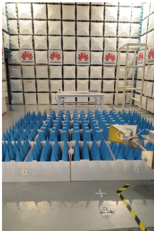
Radiated emission for 1GHz to 18GHz