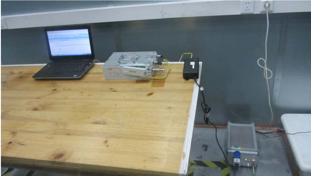
Picture 3 Conducted Emission Test Setup