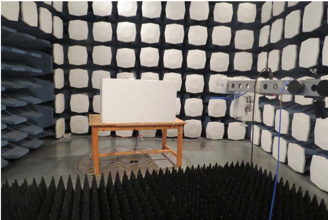
18GHz to 26.5GHz