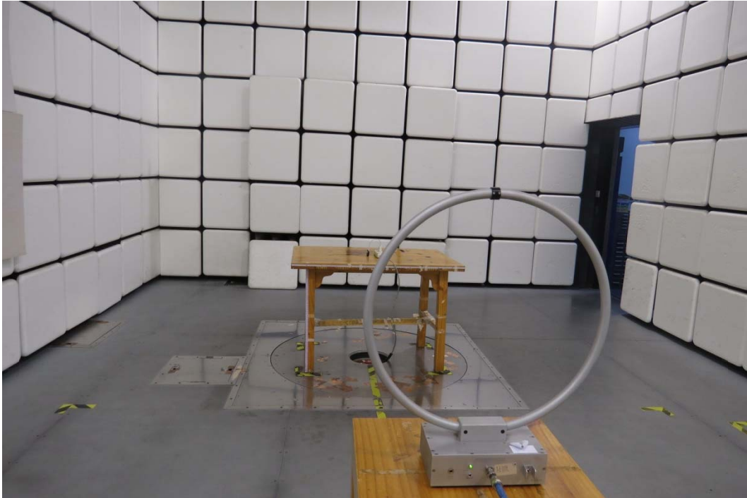
9KHz ~ 30MHz