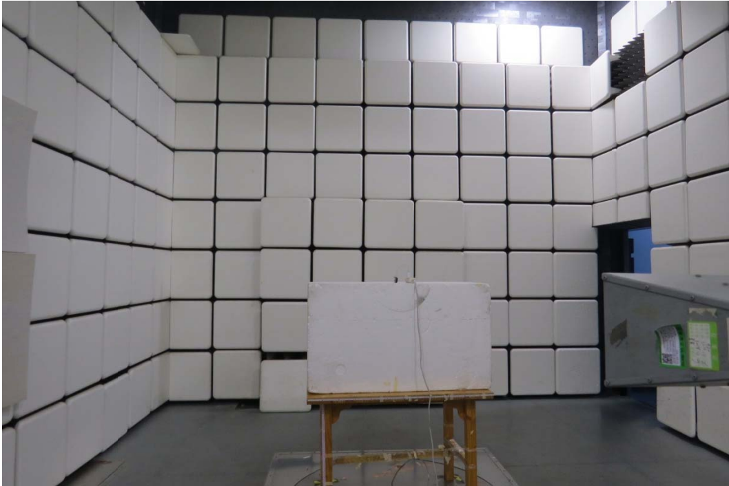
1GHz to 18GHz