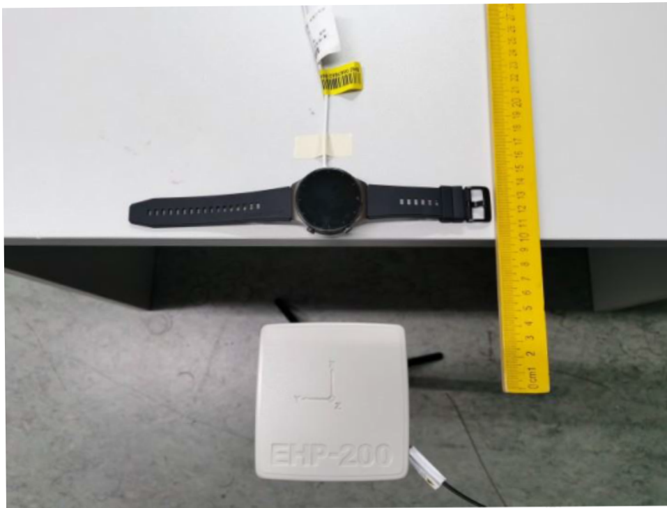
RF exposure test