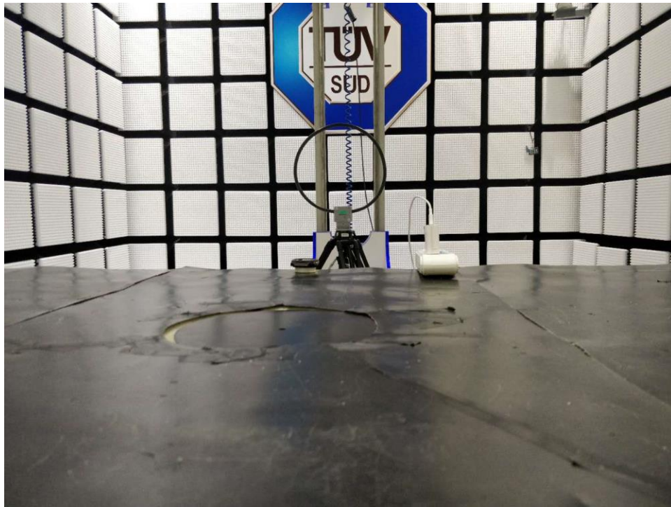
radiated spurious emission 9kHz-30MHz