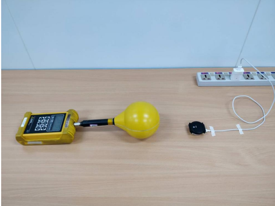
RF exposure test