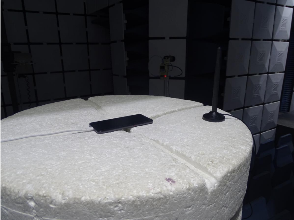
Radiated Spurious Emission (18GHz to26.5GHz)