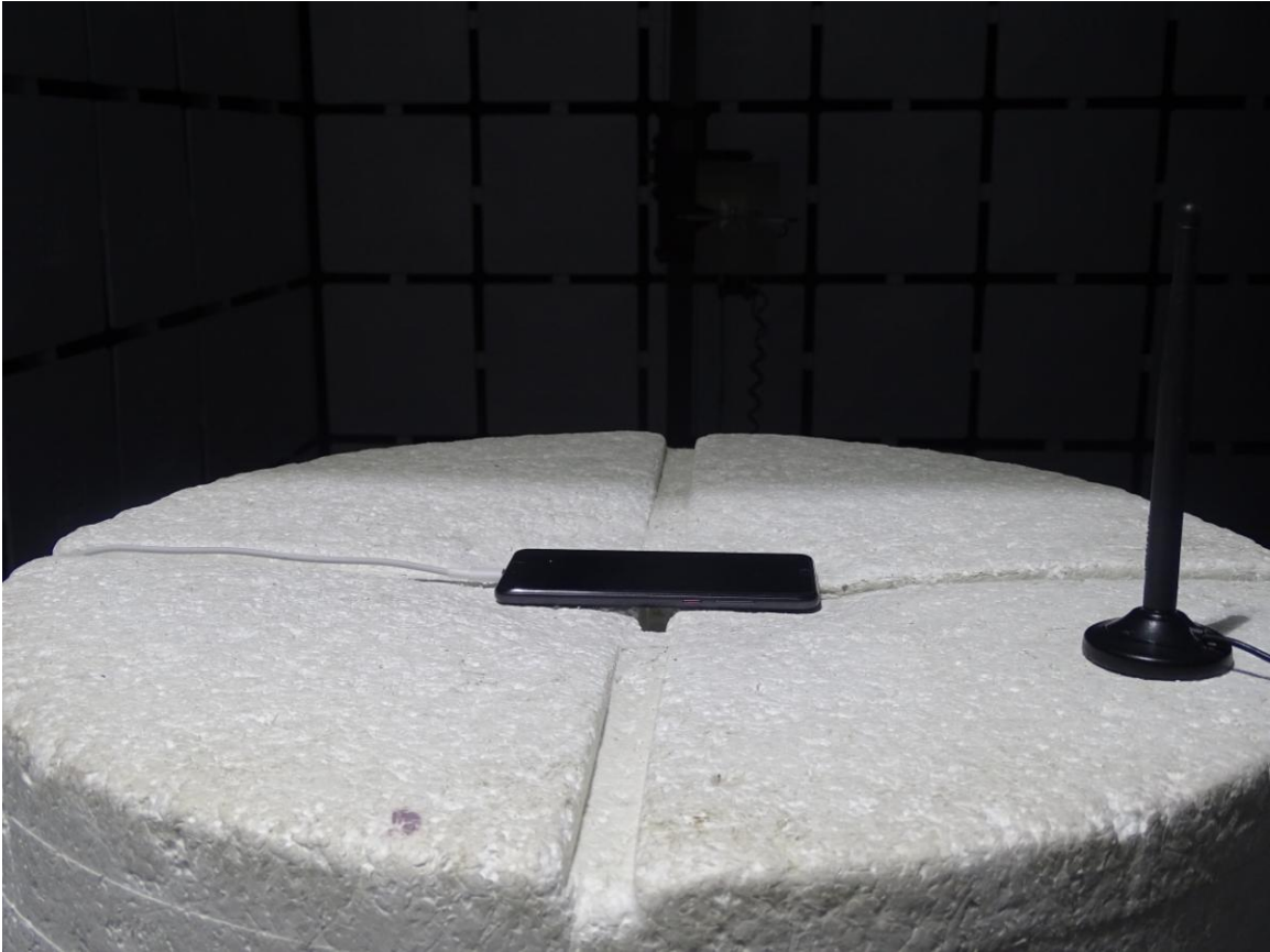
Radiated Spurious Emission (3GHz to18GHz)