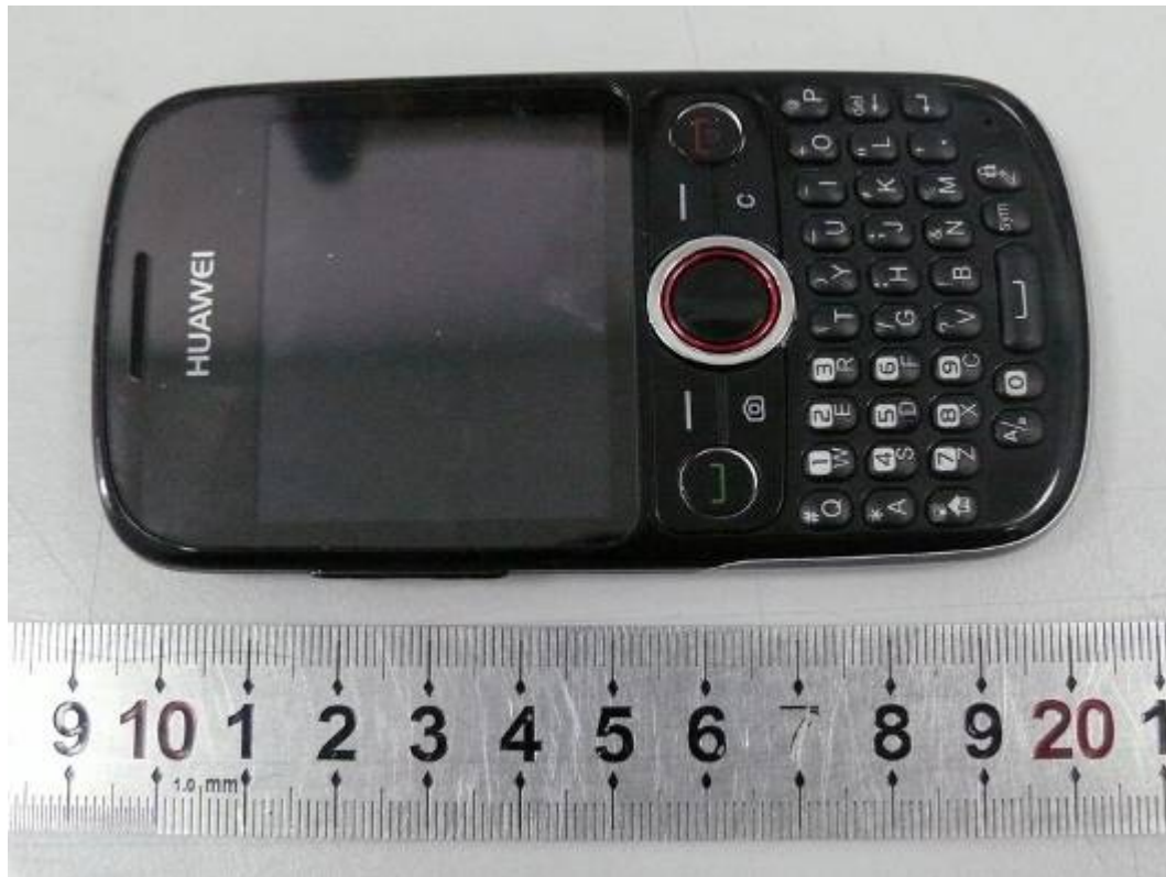
a: the EUT