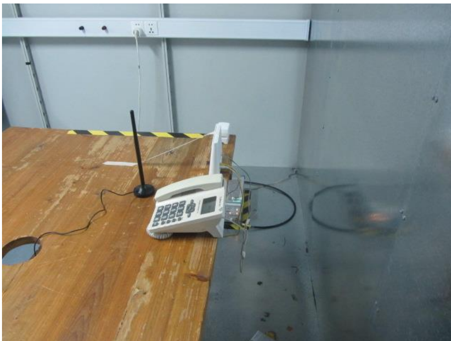
Conducted Emissions for AC Ports