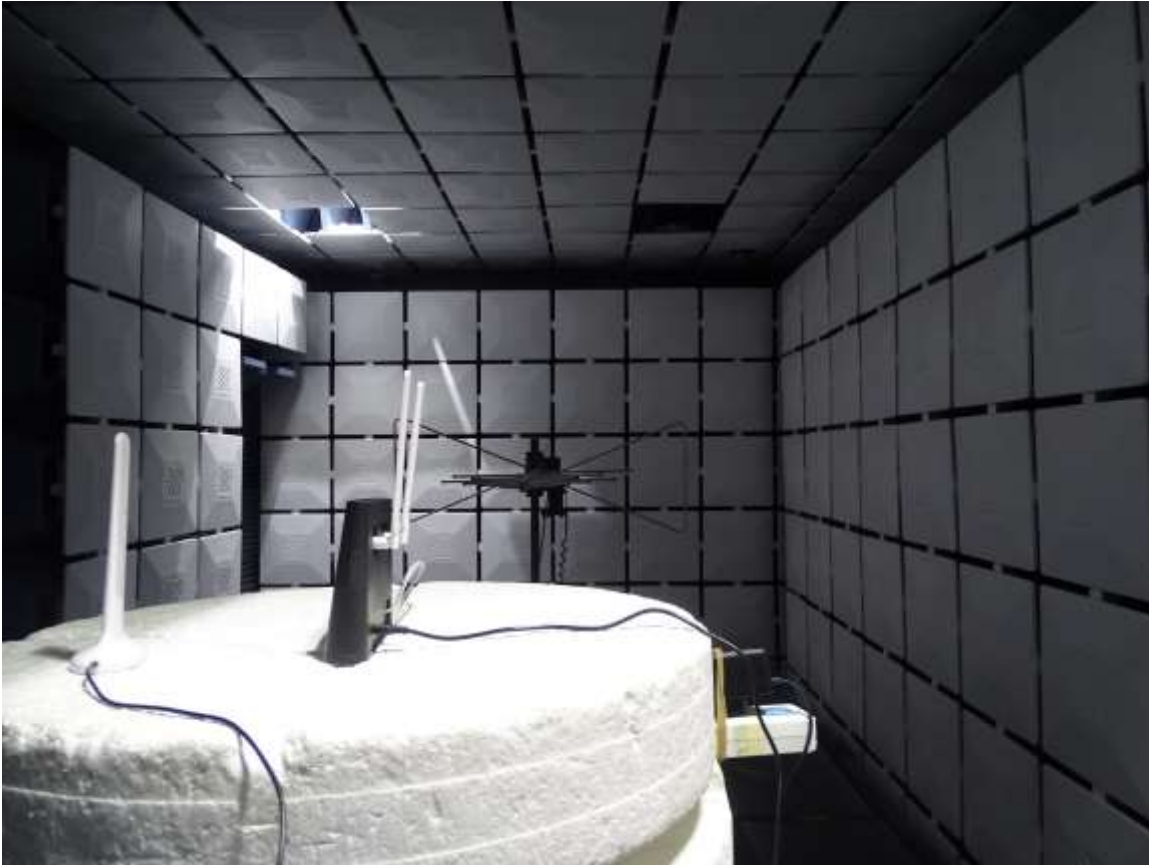
Radiated Spurious Emission (30MHz to 3GHz)