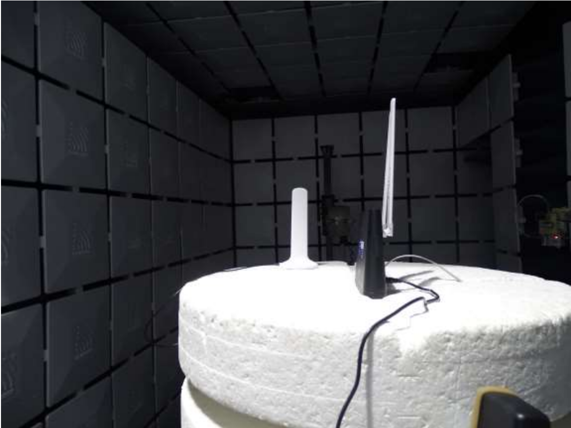
Radiated Spurious Emission (3GHz to18GHz)