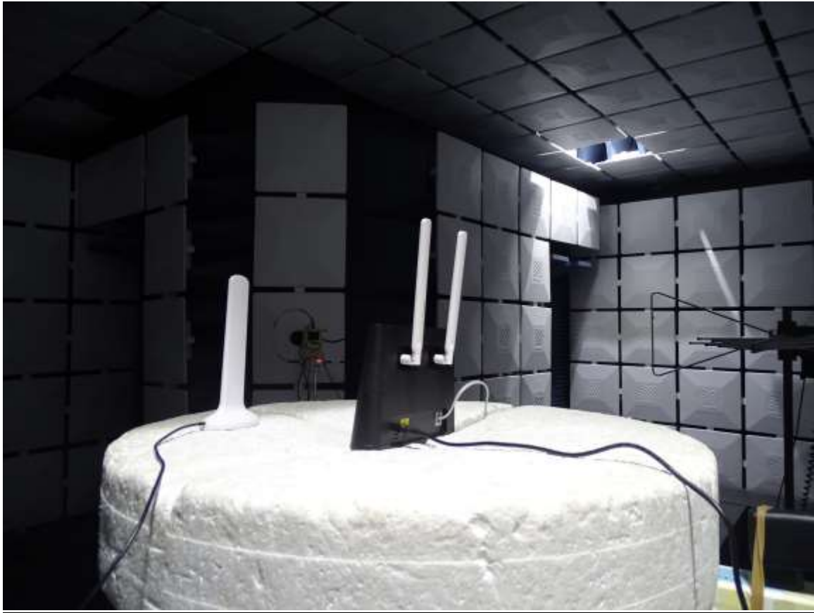
Radiated Spurious Emission (18GHz to26.5GHz)