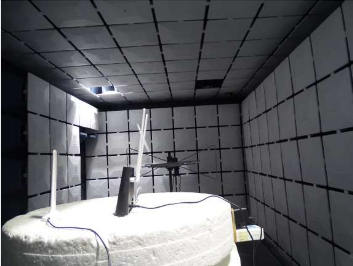
Radiated Spurious Emission (30MHz to 3GHz)