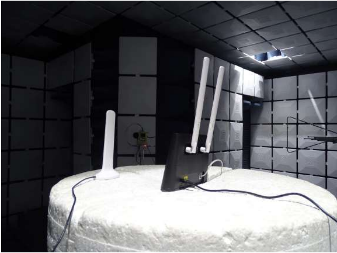
Radiated Spurious Emission (18GHz to26.5GHz)