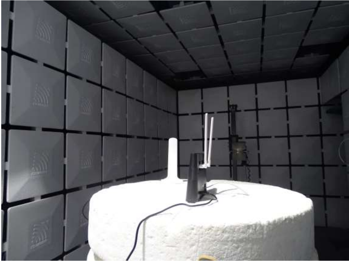
Radiated Spurious Emission (3GHz to18GHz)