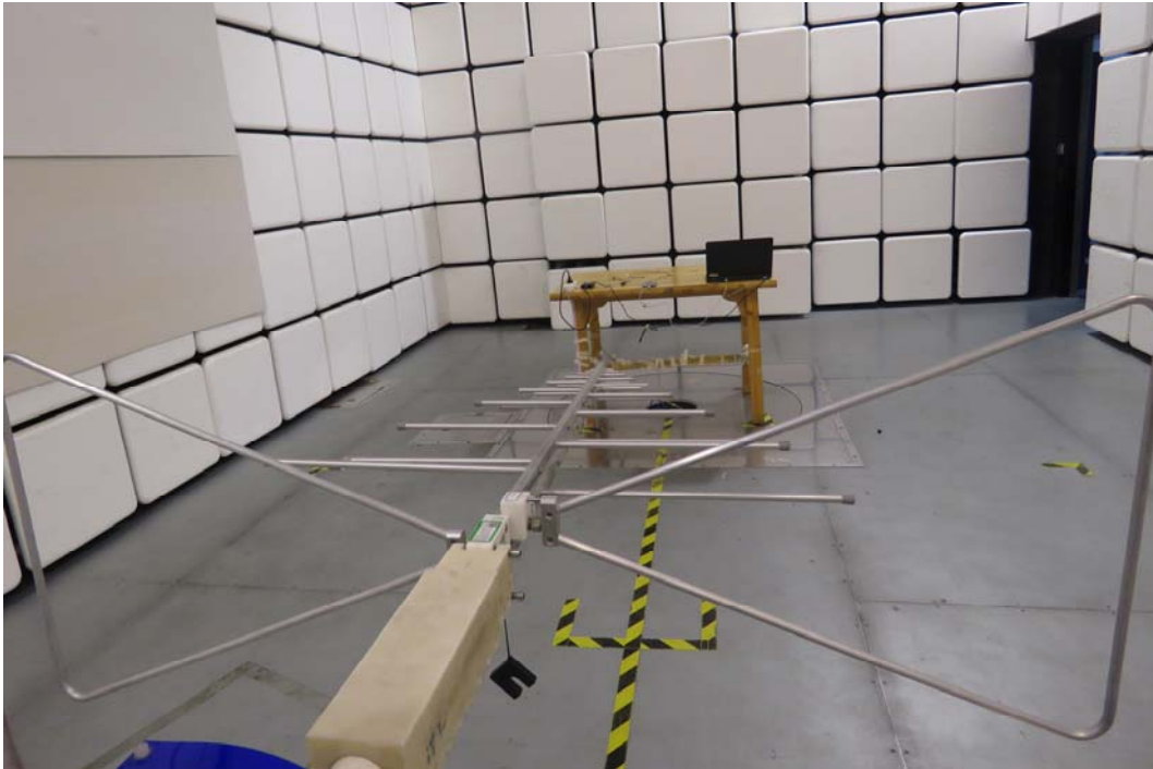
a: Below 1GHz