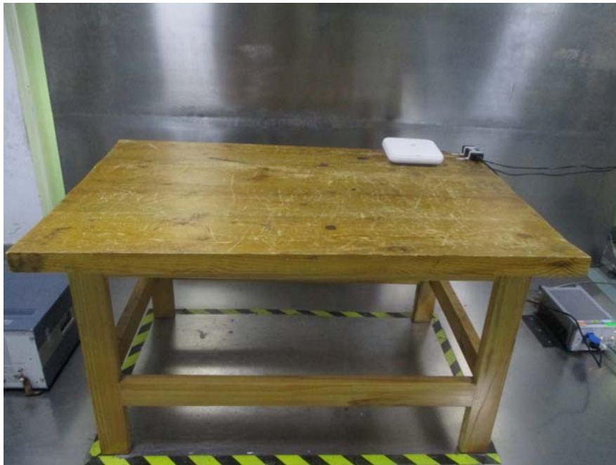
Conducted Emissions – Side View(Adapter)