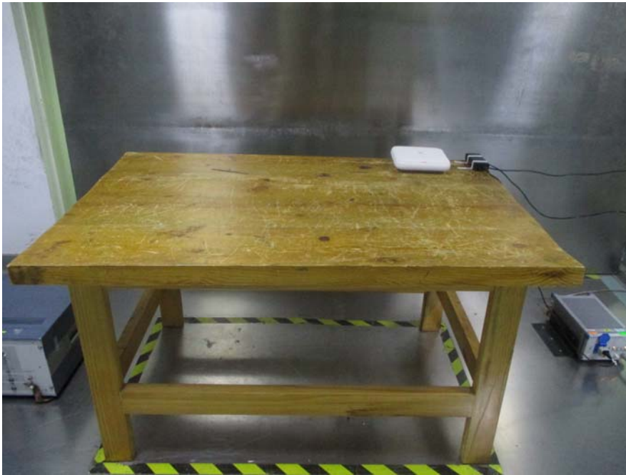
Conducted Emissions – Side View(POE)