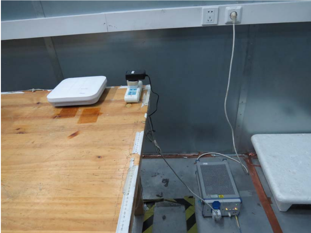
Picture 3 Conducted Emission Test Setup