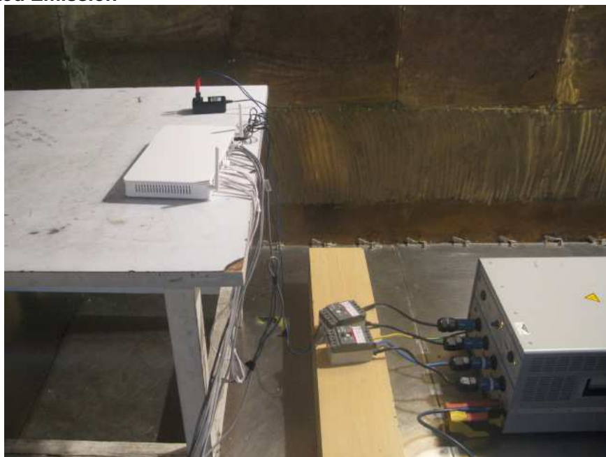
Conducted emissions of AC power port