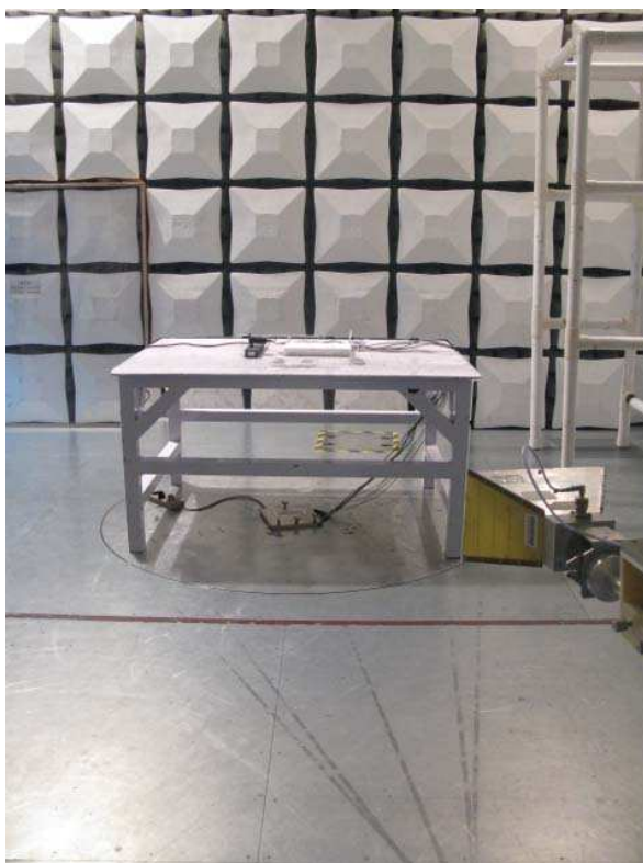
Radiated emission for 1GHz to 18GHz