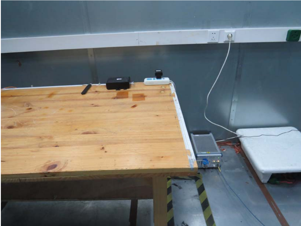
Picture 3 Conducted Emission Test Setup