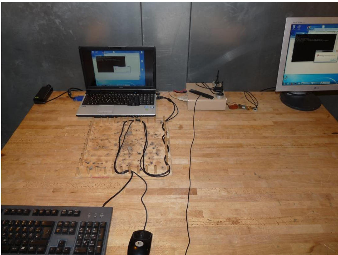
Photo 2: Test setup for conducted measurements (computer peripheral setup, EUT supplied by Serial-cable from computer, unintentional radiator §15)