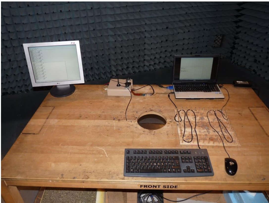
Photo 3: Test setup for radiated measurements (computer peripheral setup, EUT supplied by Serial-cable from computer, unintentional radiator §15)