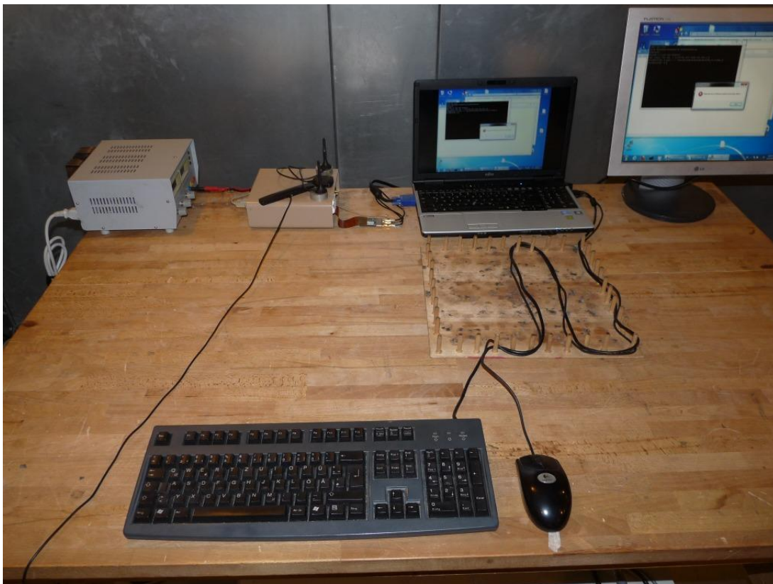
Photo 1: Test setup for conducted measurements (AC Port (power line), EUT supplied by AC/DC Power Supply, intentional / unintentional radiator §15)