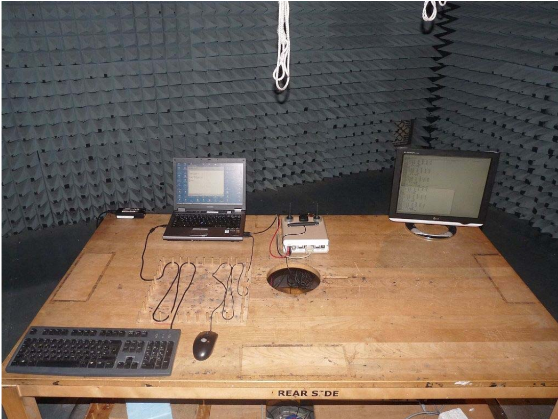
Photo 3: Test setup for radiated measurements (computer peripheral setup, EUT supplied by Serial-cable from computer, unintentional radiator $15)