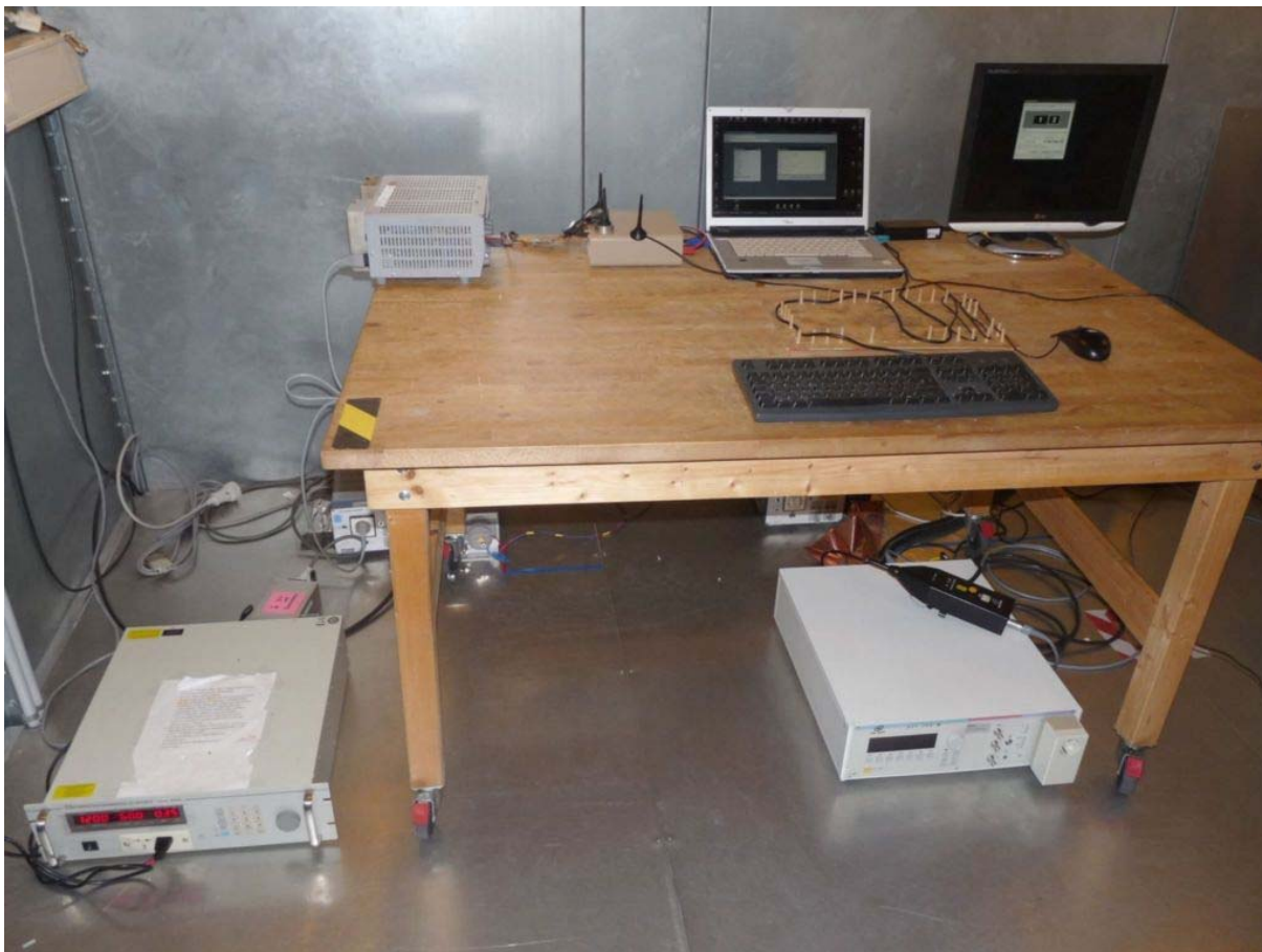
Photo 1: Test setup for conducted measurements (AC Port (power line), EUT supplied by AC/DC Power Supply, intentional / unintentional radiator §15)