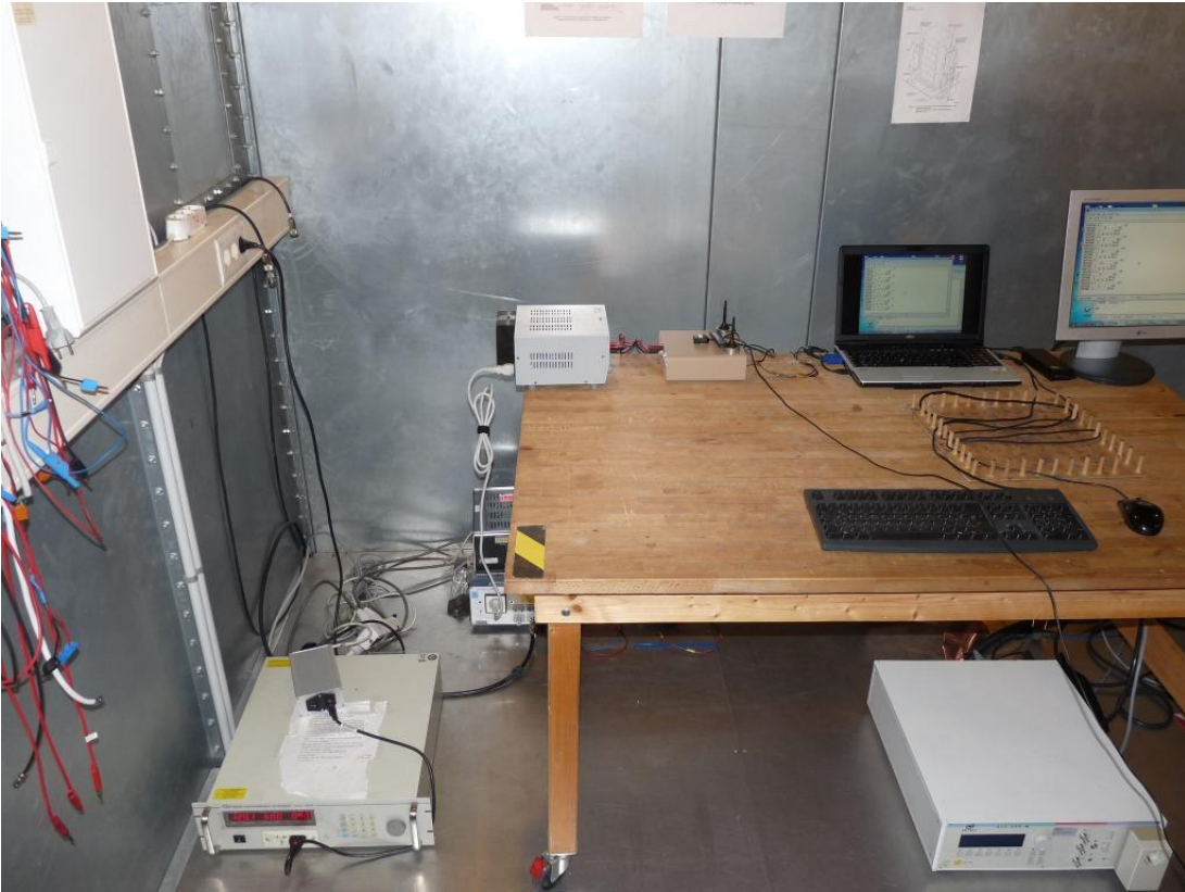
Photo 1: Test setup for conducted measurements (AC Port (power line), EUT supplied by AC/DC Power Supply, connected via USB-cable to computer, intentional / unintentional radiator §15)