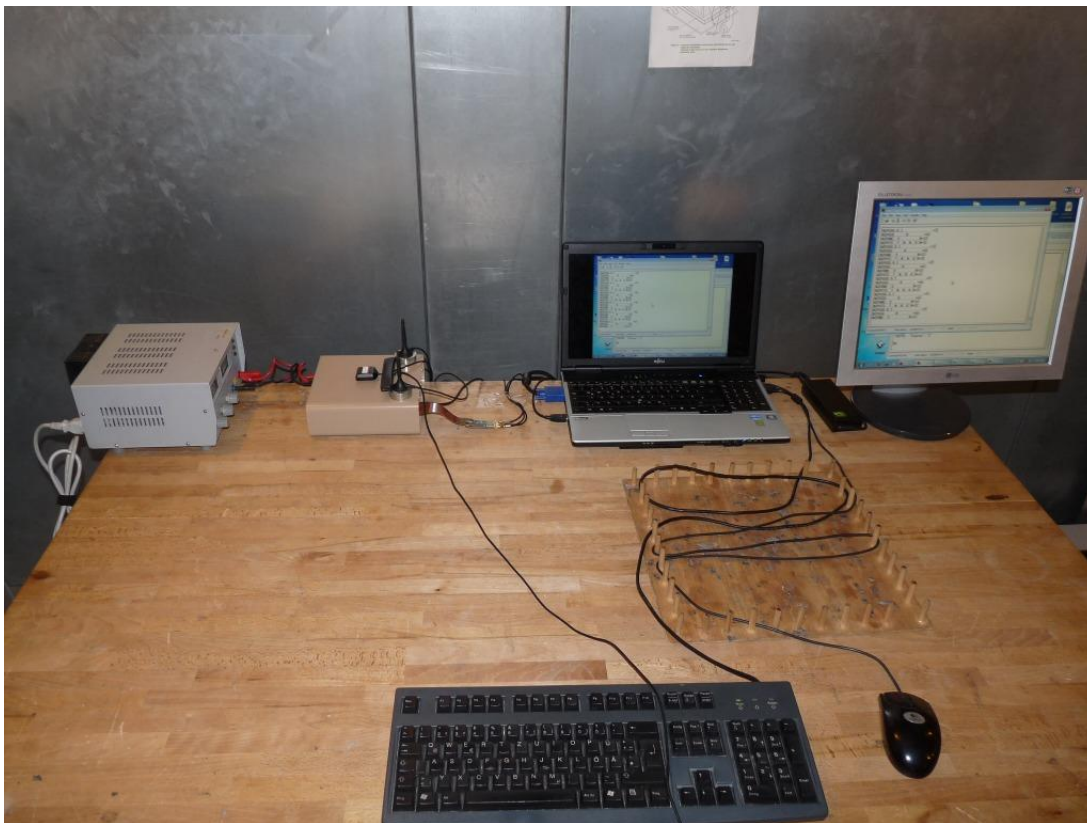
Photo 2: Test setup for conducted measurements (AC Port (power line), EUT supplied by AC/DC Power Supply, connected via USB-cable to computer, intentional / unintentional radiator §15)