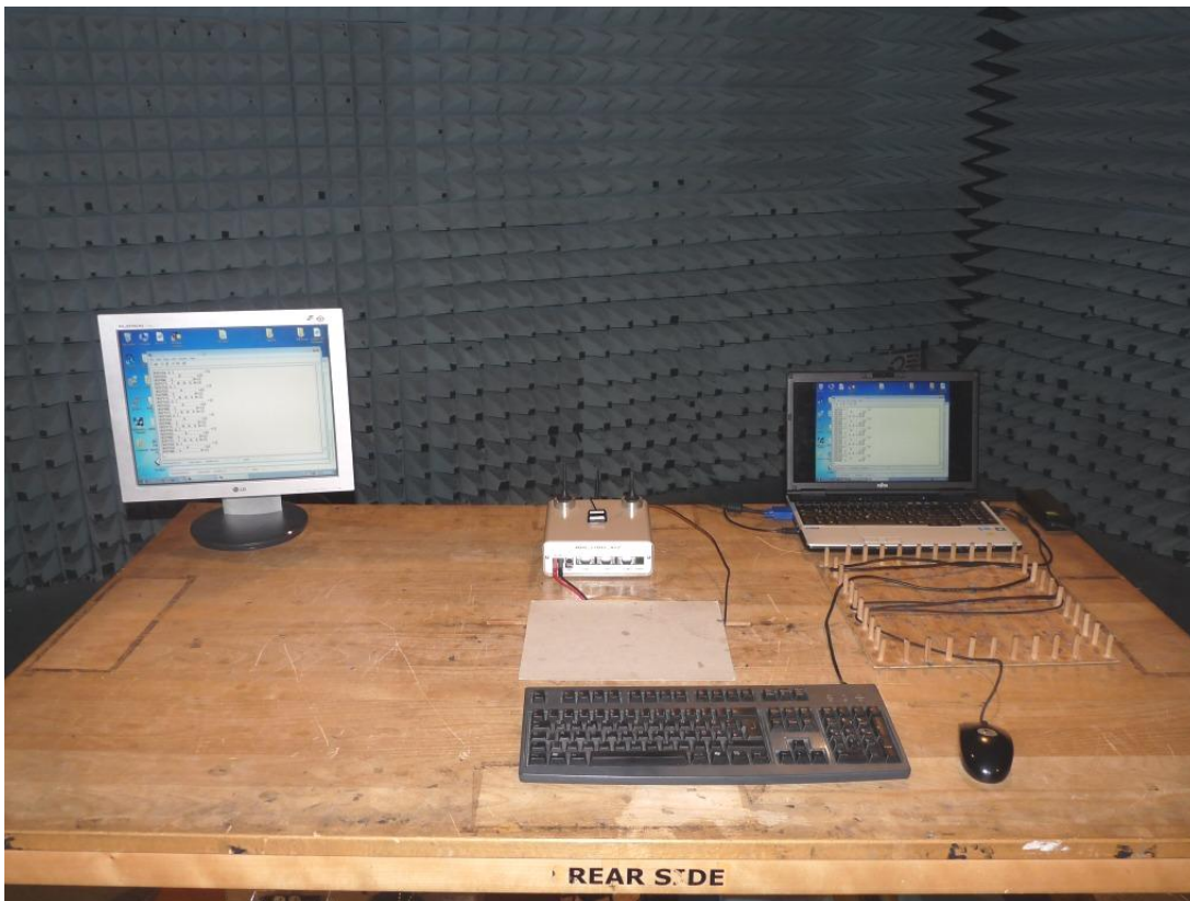
Photo 3: Test setup for radiated measurements (computer peripheral setup, EUT supplied by Serial-cable from computer, unintentional radiator §15)