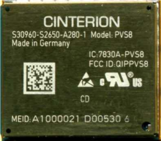
PVS8 Top side