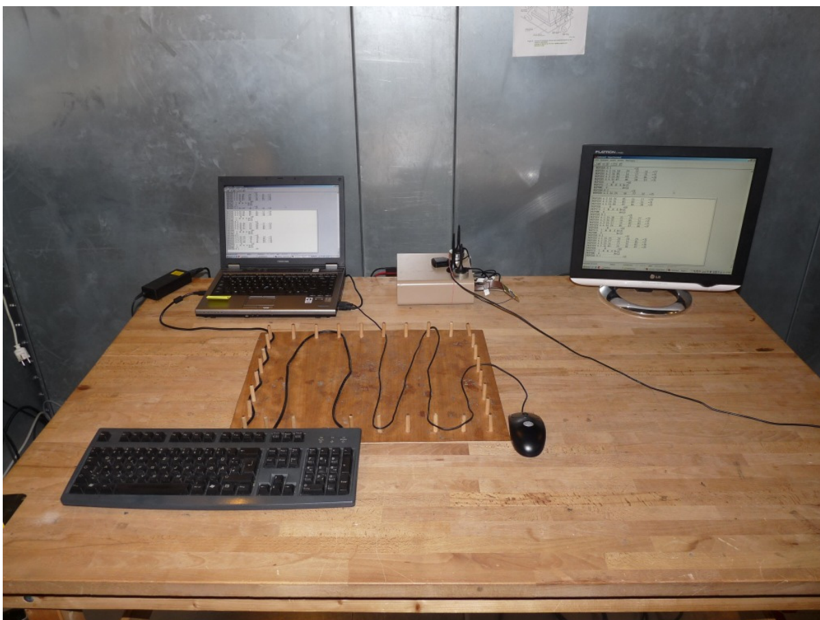
Photo 3: Setup for conducted tests, conducted emissions AC Mains acc. to FCC Part 15B, computer peripheral setup