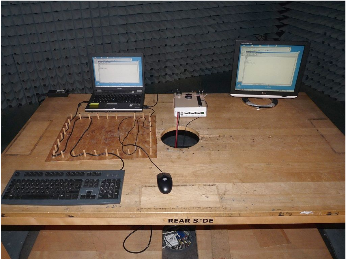
Photo 2: Setup for radiated tests, spurious emissions acc. to FCC Part 15B computer peripheral setup