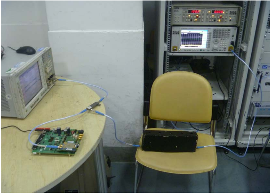
Frequency Stability Under Temperature & Voltage Variations Setup