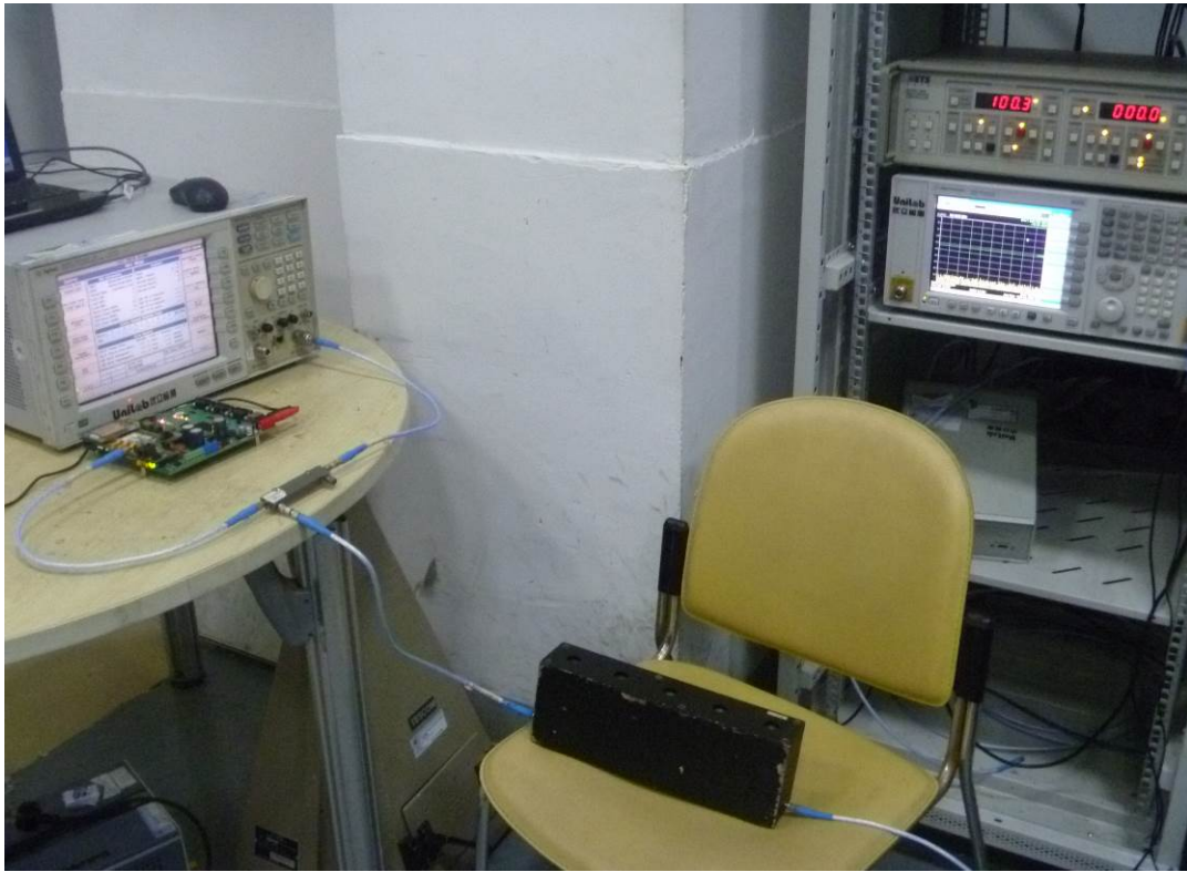
Frequency Stability Under Temperature & Voltage Variations Setup