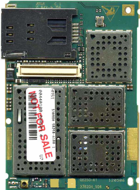
Siemens Cellular Engine HMS1 Top side without shielding