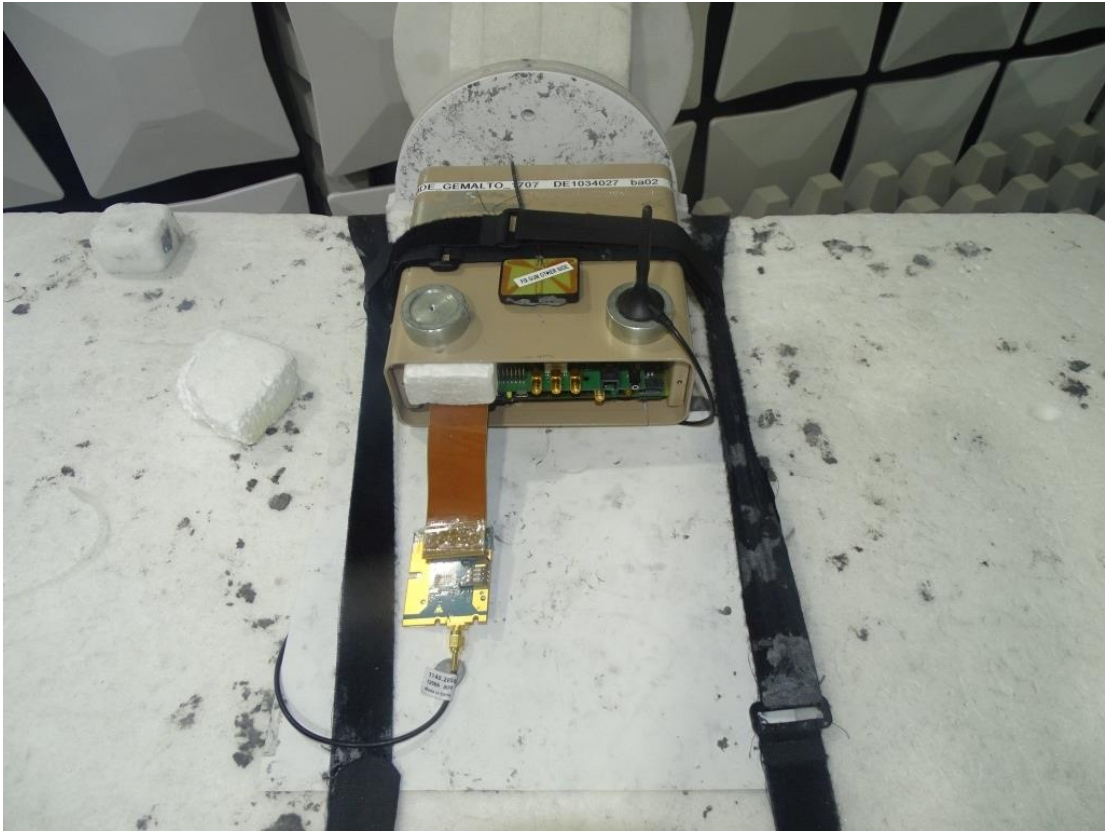
Photo 2: Test setup for radiated measurements (Enclosure, fully-anechoic chamber, 30 MHz – 10/20 GHz § 24/27)