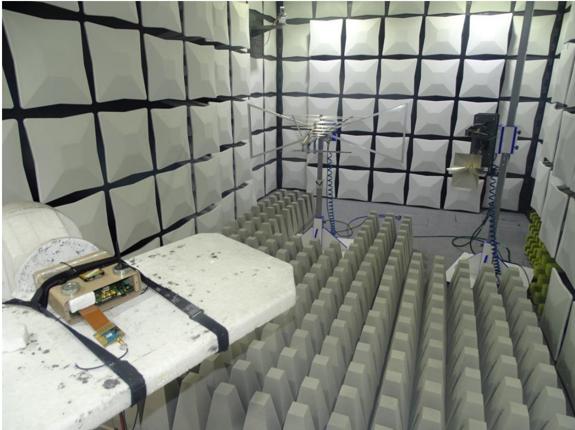
Photo 1: Test setup for radiated measurements (Enclosure, fully-anechoic chamber, 30 MHz – 10/20 GHz § 24/27)