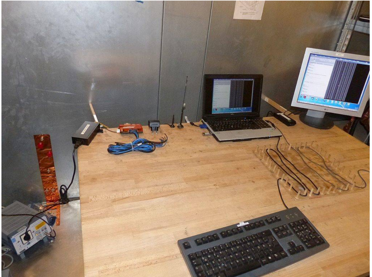
Photo 5: Test setup for conducted measurements (computer peripheral setup, EUT supplied by PoE injector, measured at power-over-Ethernet injector, unintentional radiator §15.107, ANSI C63.4)