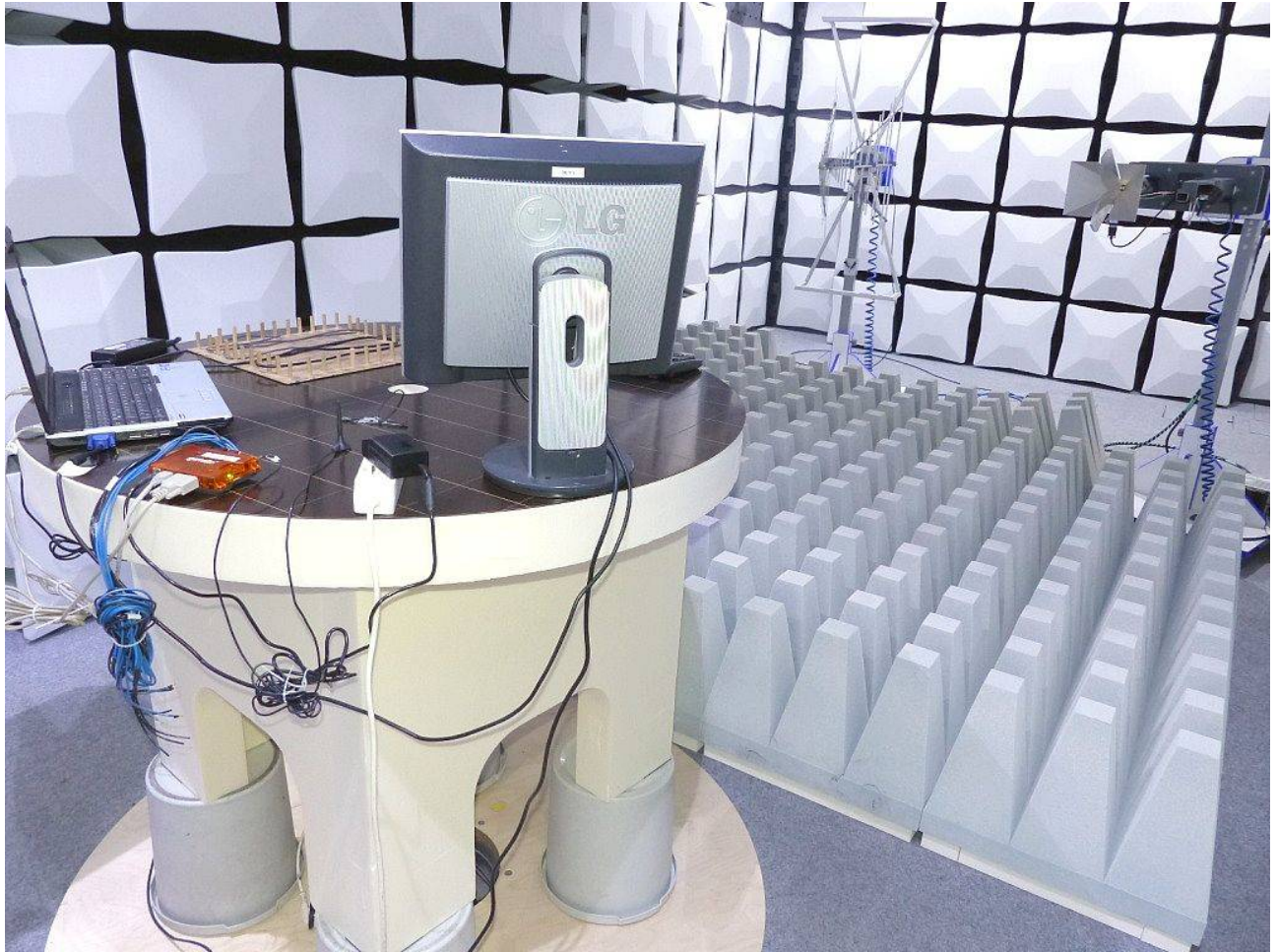
Photo 2: Test setup for radiated measurements (Enclosure, fully-anechoic chamber, 1-3 GHz, unintentional radiator §15.109, ANSI C63.4)