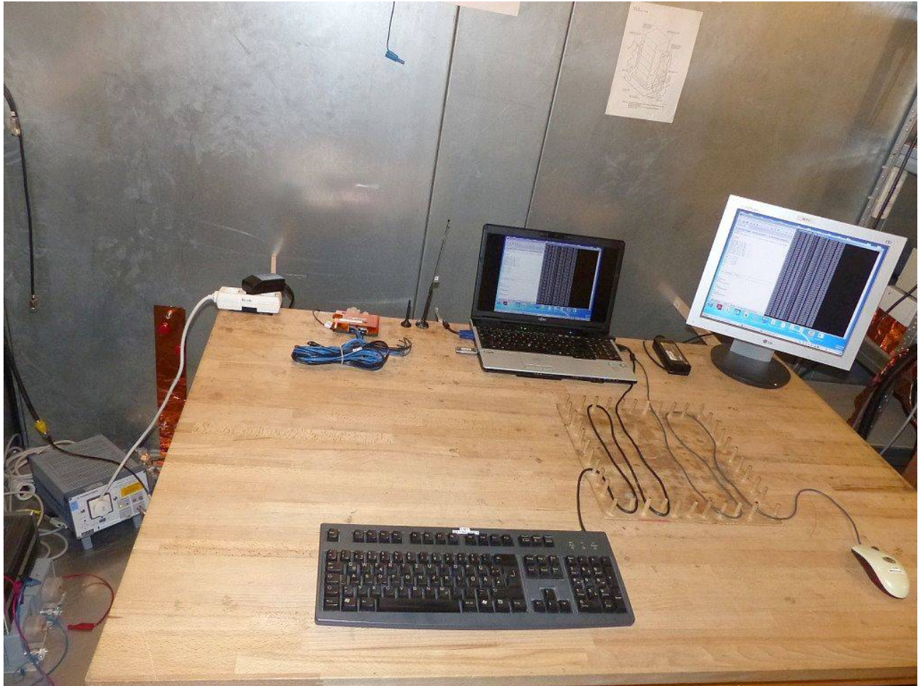
Photo 3: Test setup for conducted measurements (computer peripheral setup, EUT supplied by AC/DC adapter, measured at this AC/DC adapter), unintentional radiator §15.107, ANSI C63.4)