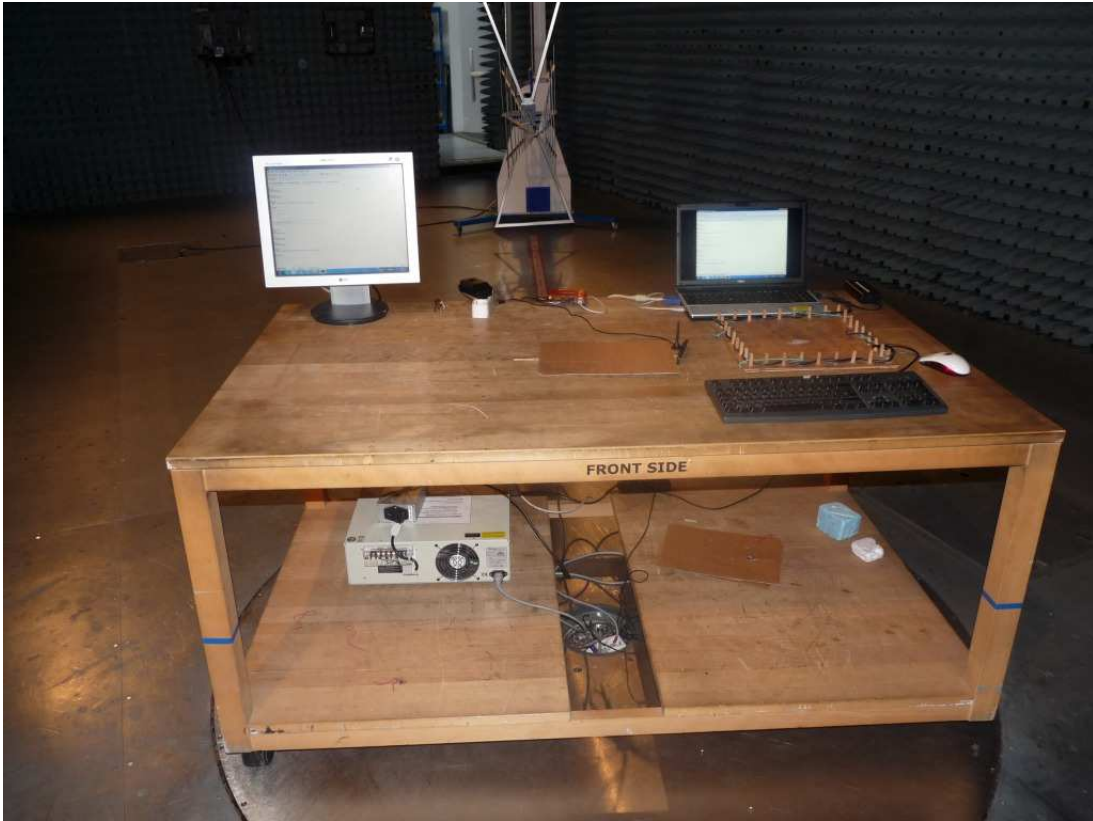
Photo 1: Test setup AA01 for radiated measurements unintentional radiator §15) Single device setup, computer peripheral.