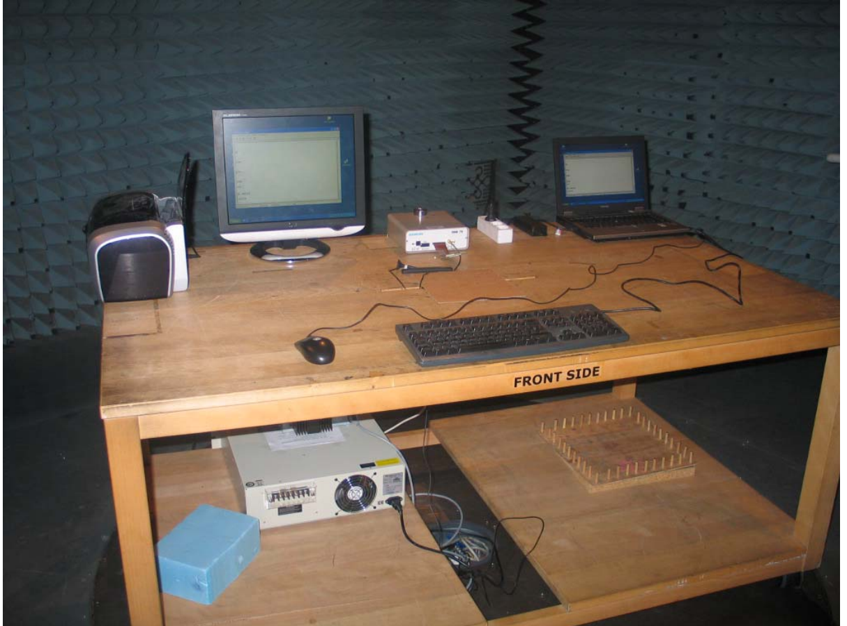
setup for radiated testing