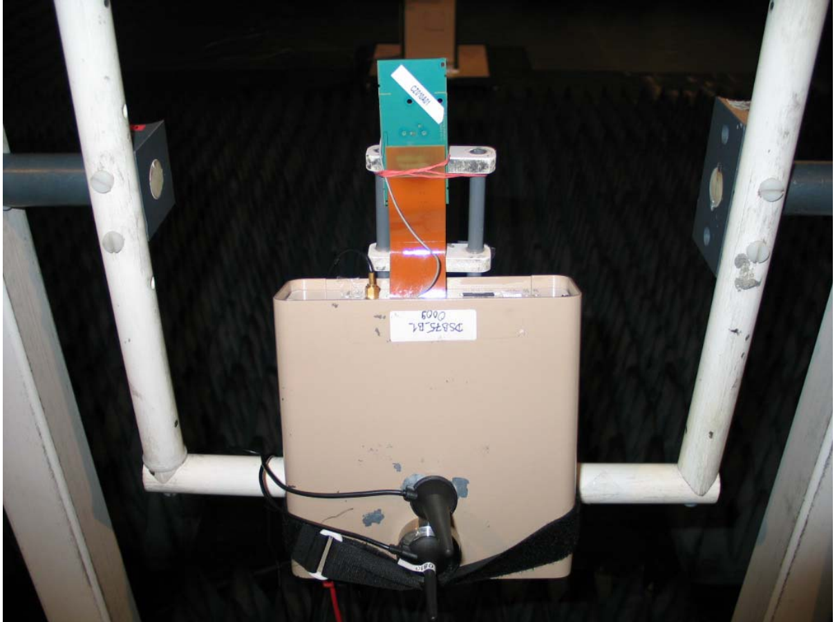
setup for radiated tests