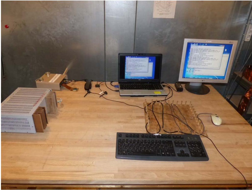
Photo 4: Test setup for conducted measurements (AC Port (power line), EUT supplied by Laboratory Power Supply, connected via RS232 to computer, intentional / unintentional radiator §15) Test Port: Laboratory Power Supply