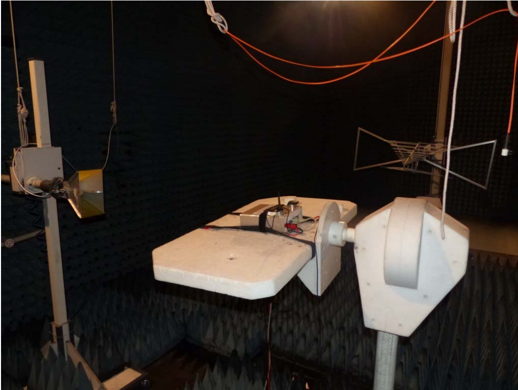
Photo 2: Test setup for radiated measurements (Enclosure, fully-anechoic chamber, 1-18 GHz intentional radiator §15 / 30 MHz – 10/20 GHz §22/24/27)