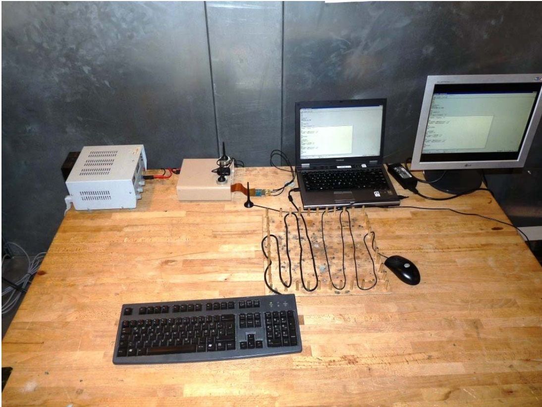
Photo 1: Test setup for conducted measurements (AC Port (power line), EUT supplied by AC/DC Power Supply, intentional / unintentional radiator §15)