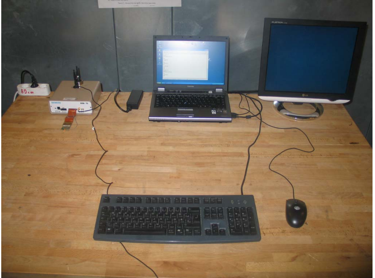
setup for conducted tests