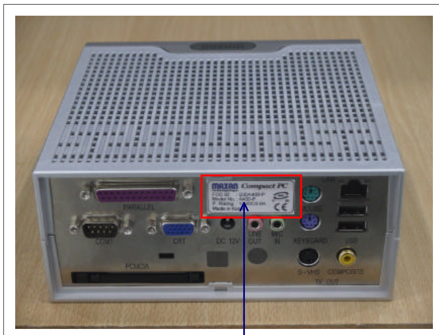
FCC Identifier Location FCC ID : QIDA400-P