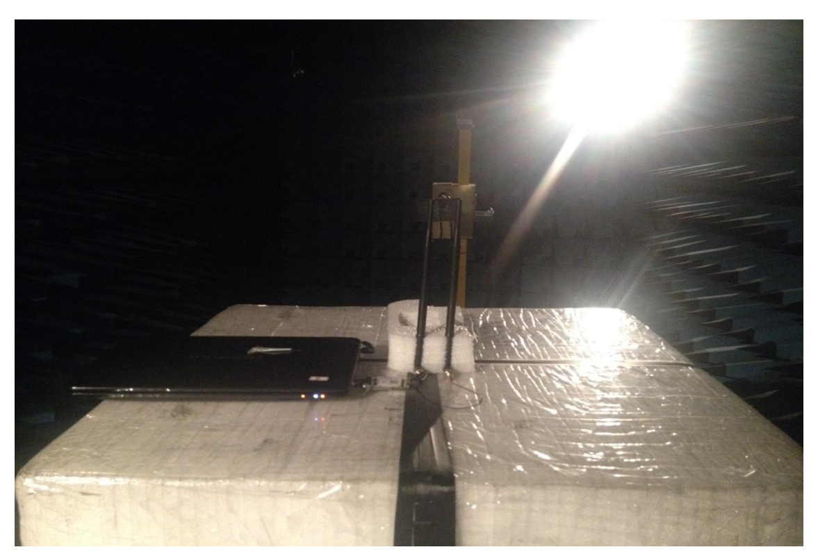
For Antenna P/N: DA-B41-16-01-BL