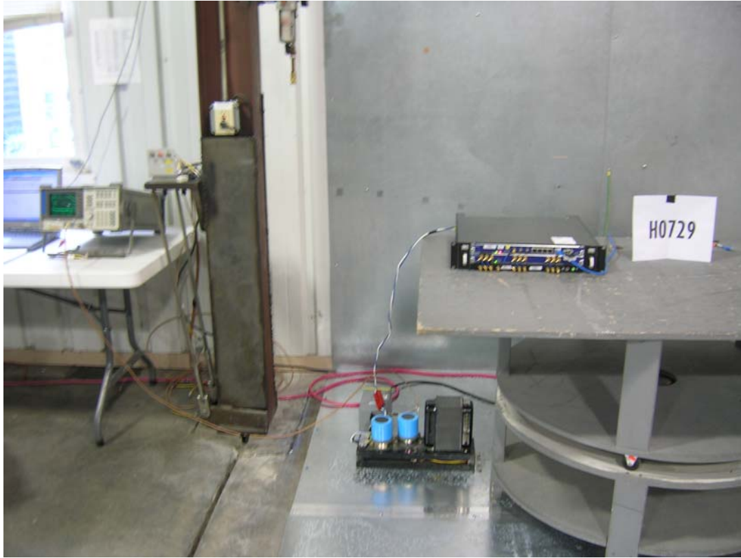
Line Conducted Emissions