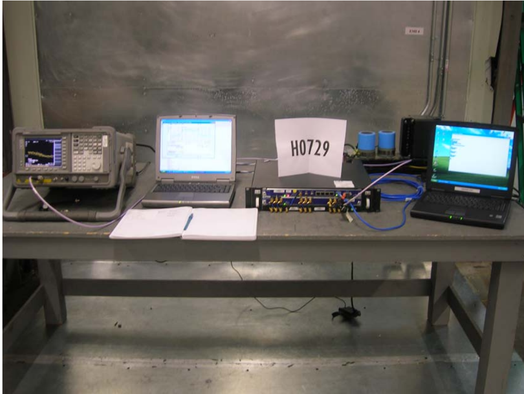
Antenna Port Conducted Measurements