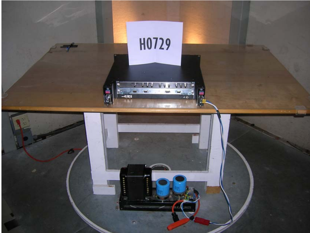
Radiated Emissions - Back