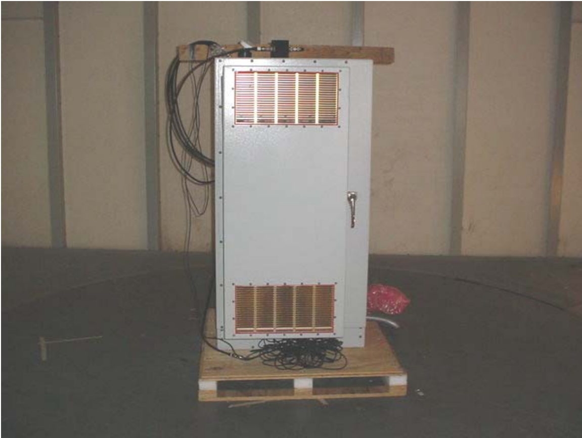
Radiated Emissions – Front