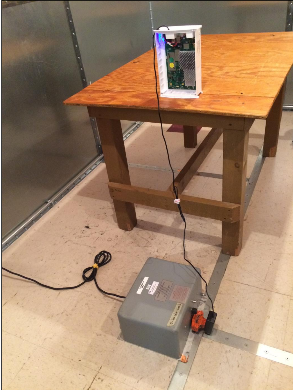
Photograph 1. Conducted Emissions, 15.207(a), Test Setup