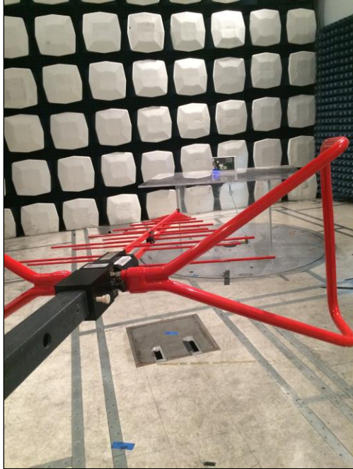
Photograph 2. Radiated Spurious Emissions, Test Setup, 30 MHz – 1 GHz