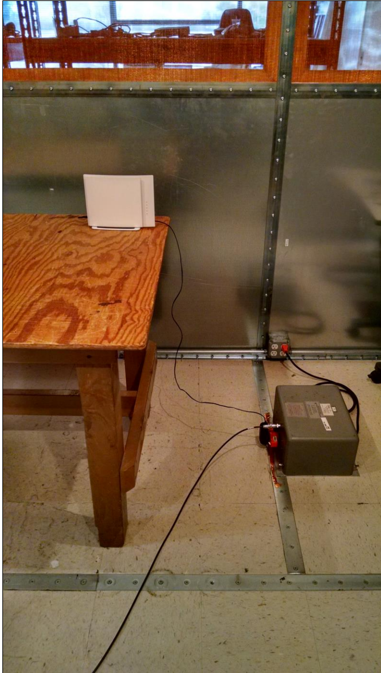
Photograph 1. Conducted Emissions, 15.207(a), Test Setup