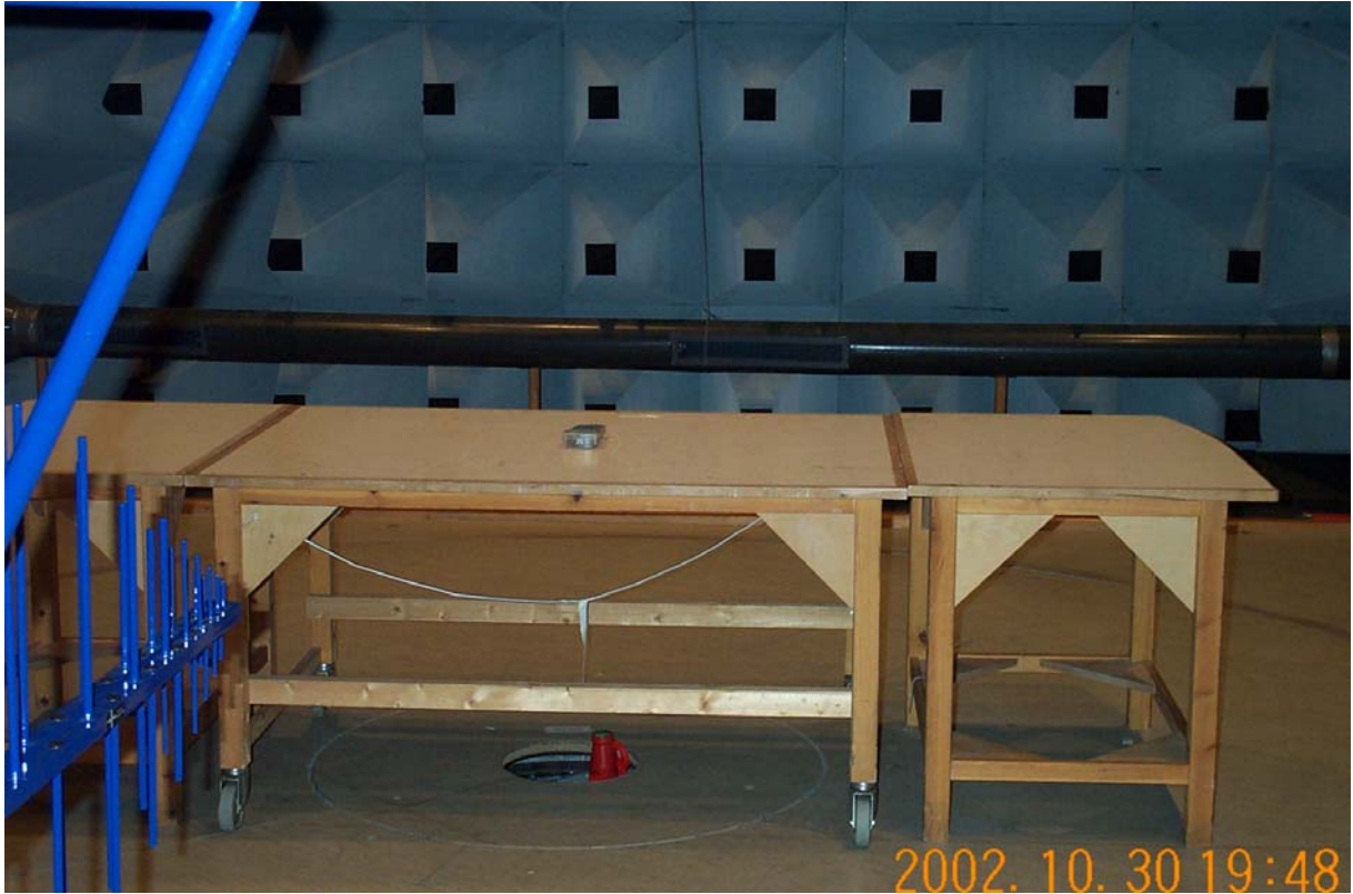
Photo 1 Set-up for measurements 30 - 1000 MHz