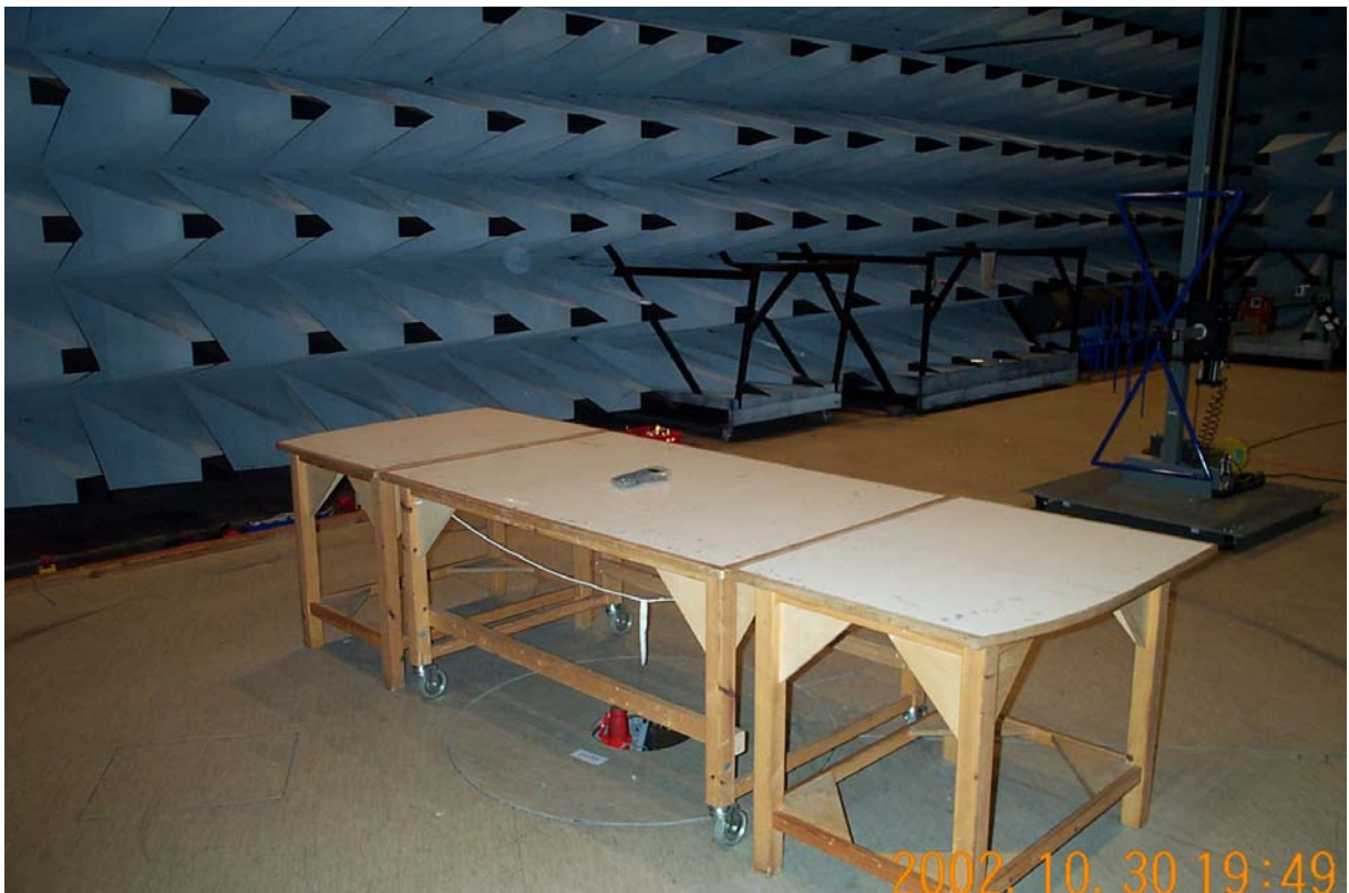
Photo 2 Set-up for measurements 30 - 1000 MHz.