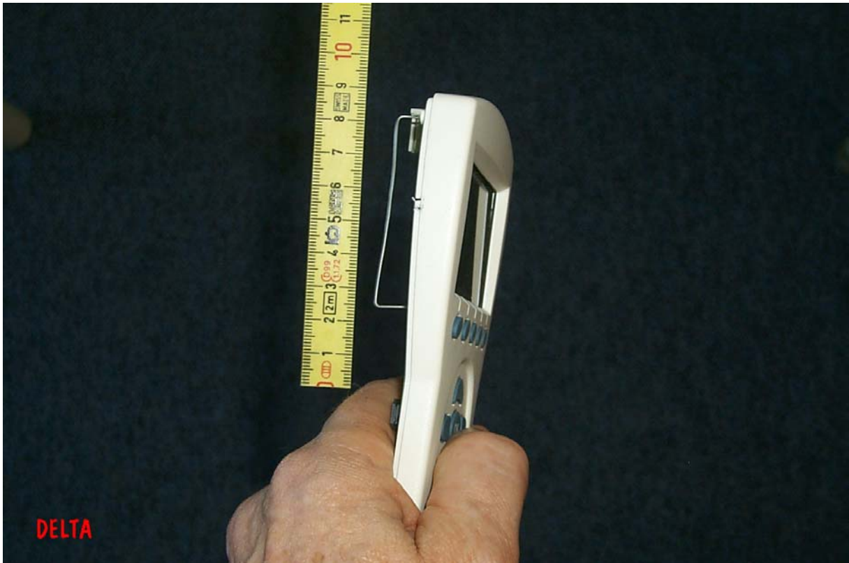
Photo 4 Distance between antenna and hand will be larger than 2.5 cm.