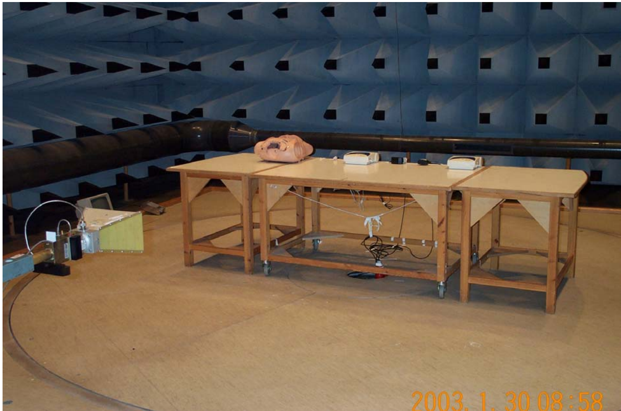
Photo 3 Set-up for measurements 1 - 10 GHz. One unit in Tx-mode and one in Rx-mode.