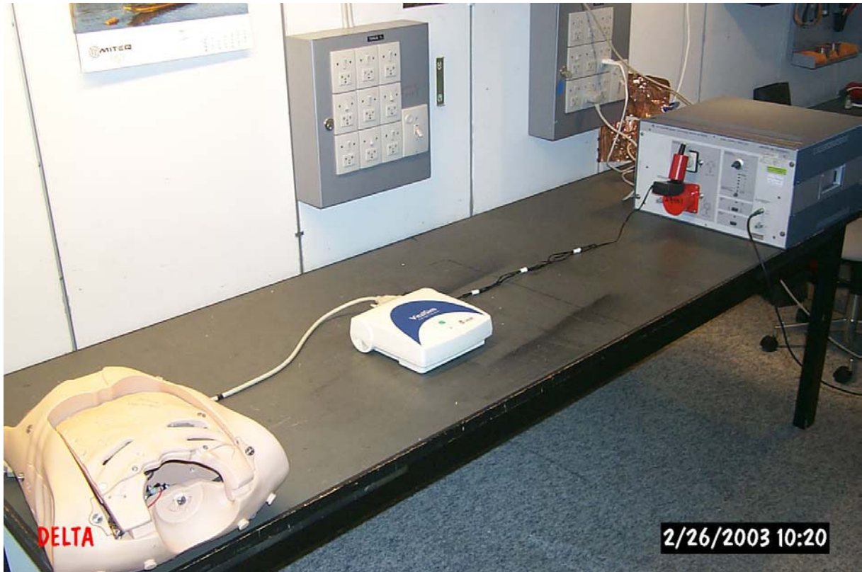
Photo 1 Set-up for measurements of conducted emission.