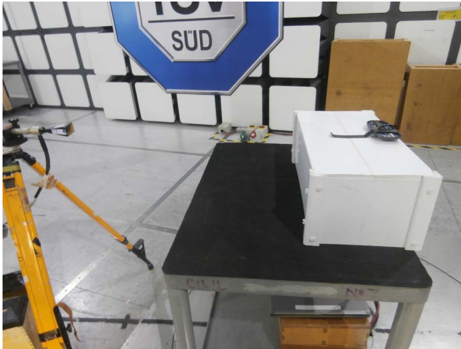
Radiated Emissions 18 GHz to 25 GHz