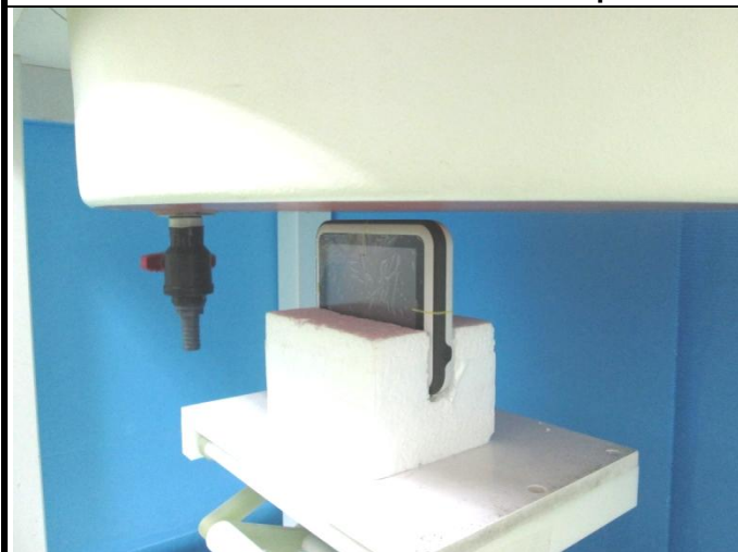
Left Side of EUT with 0.5 cm Gap