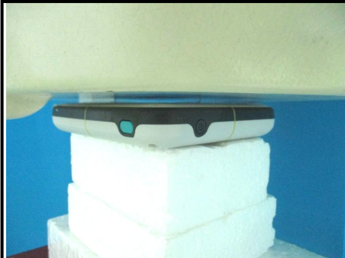
Front Face of EUT with 0.5 cm Gap