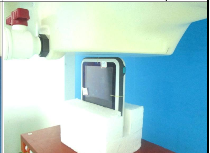
Top Side of EUT with 0.5 cm Gap