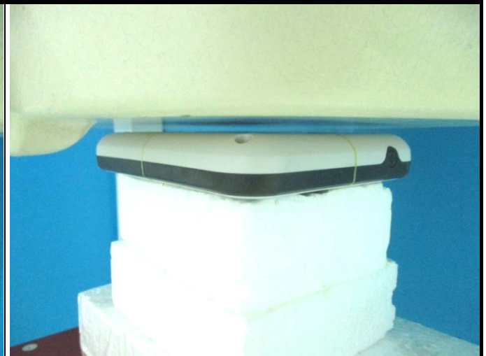
Rear Face of EUT with 0.5 cm Gap