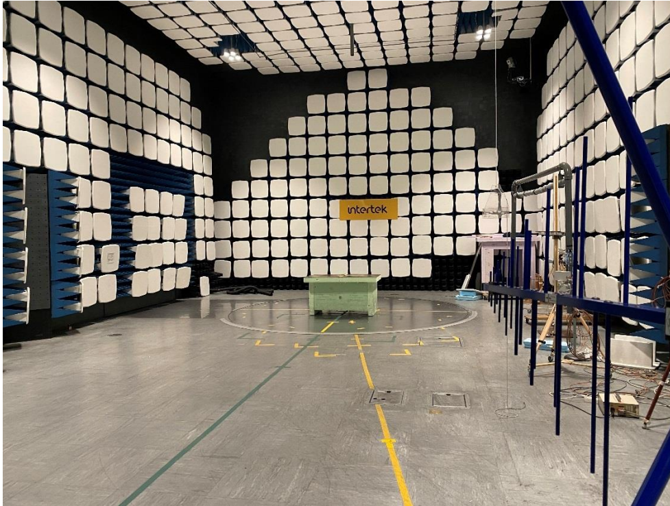
Test set up radiated emission 30 MHz – 1 GHz